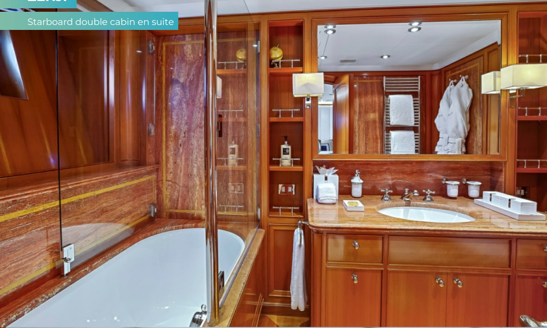
Starboard double cabin en suite