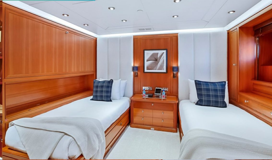
Starboard twin cabin with pullman