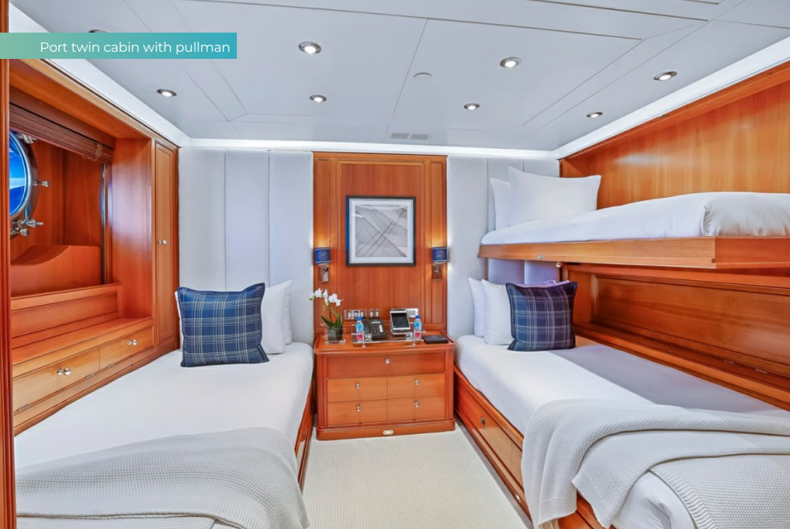
Port twin cabin with pullman