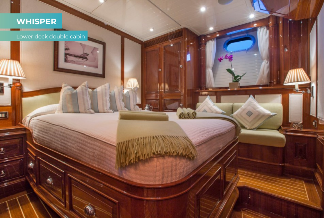
Lower deck double cabin