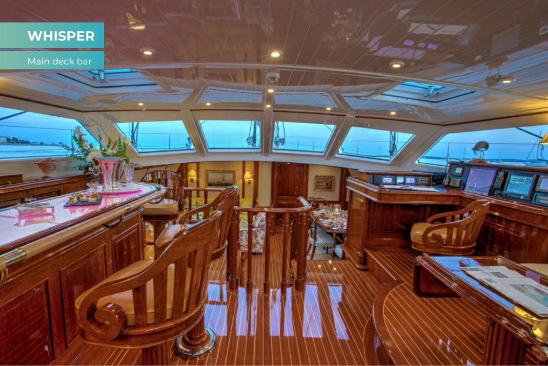
Main deck bar