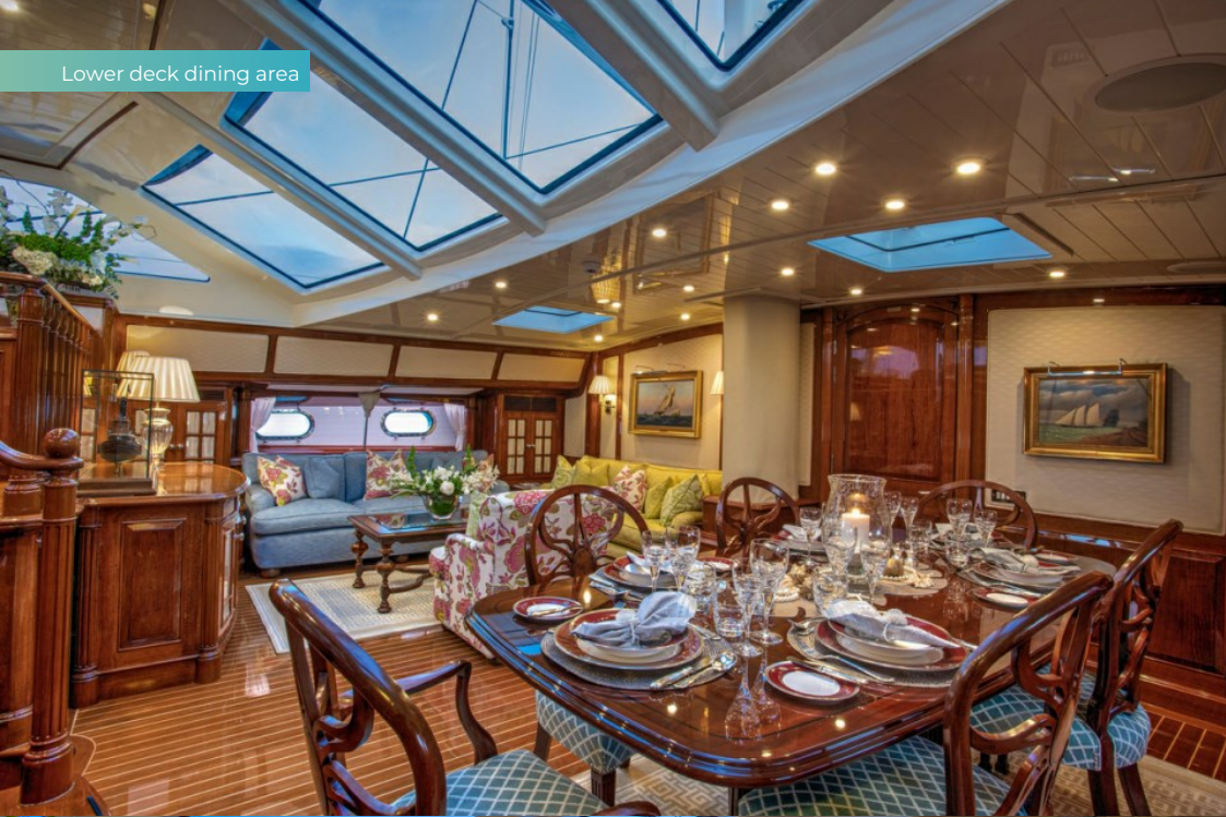
Lower deck dining area