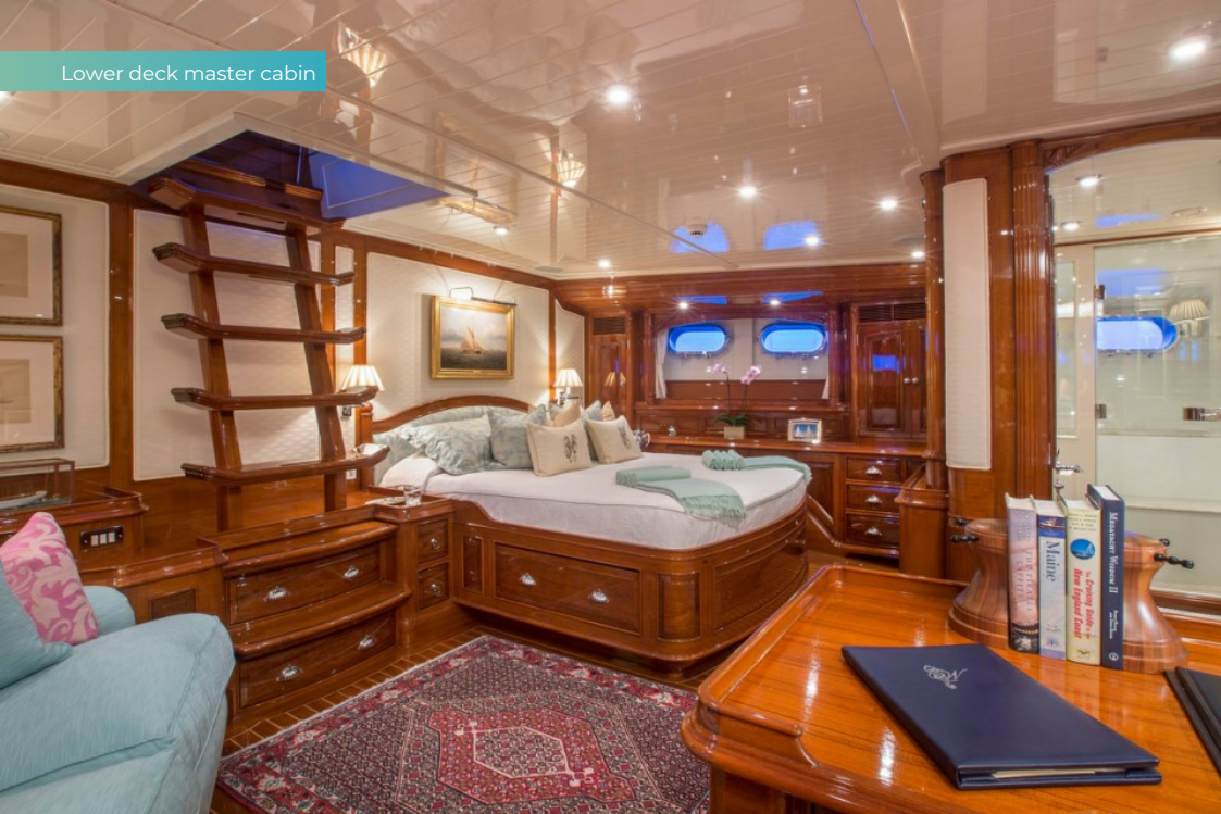
Lower deck master cabin