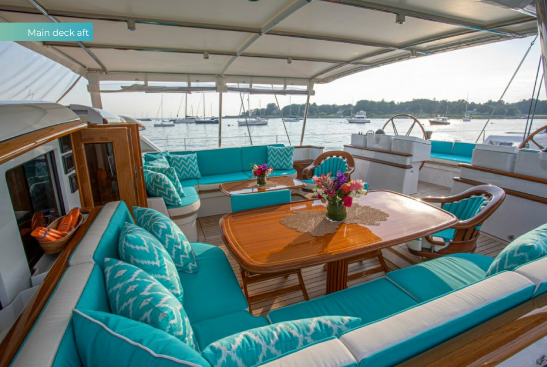
Main deck aft