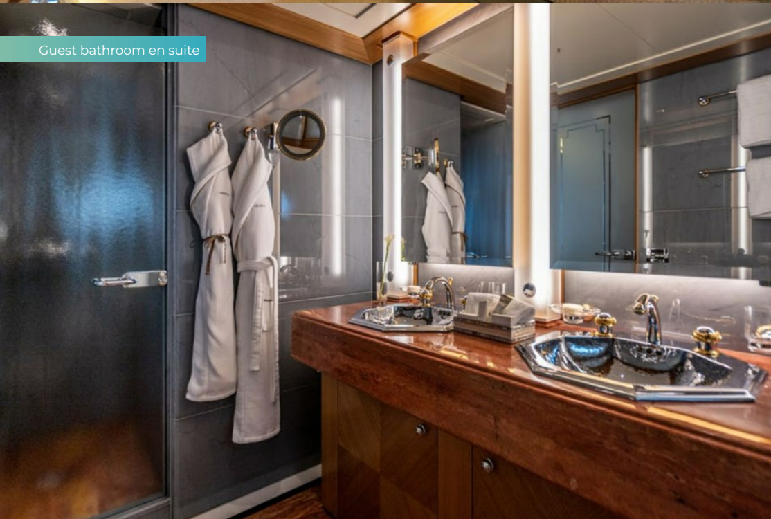
Guest bathroom en suite