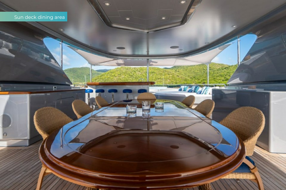
Sun deck dining area