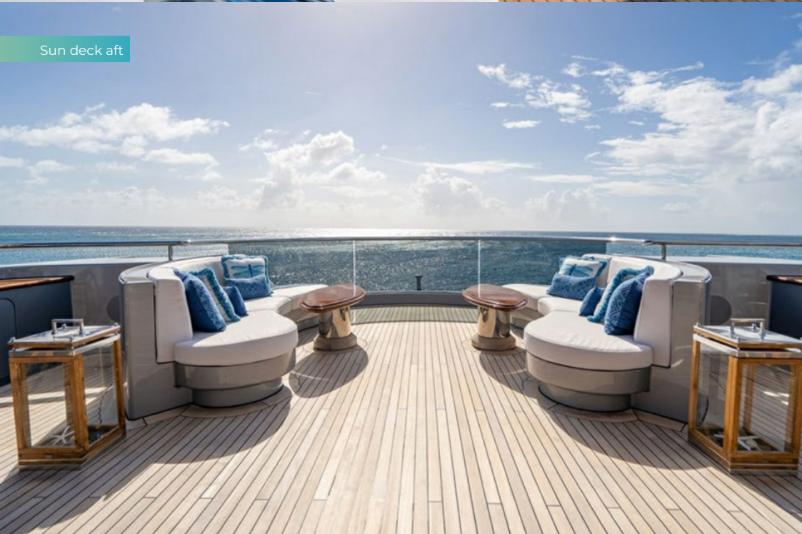
Sun deck aft