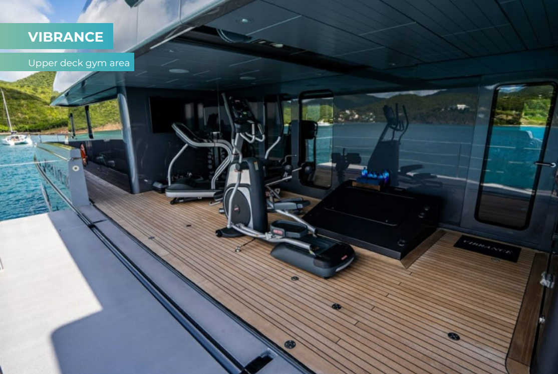
Upper deck gym area