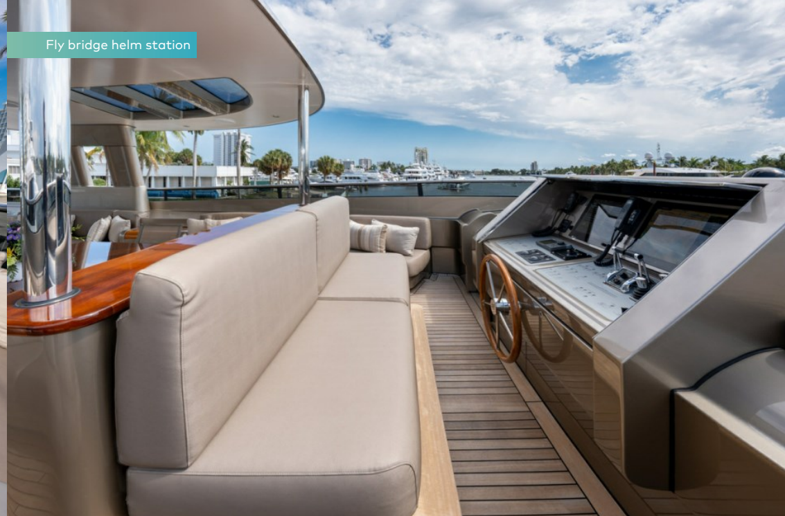
Fly bridge helm station