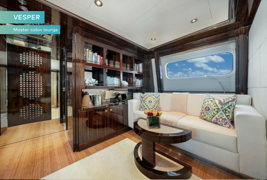
Master cabin lounge