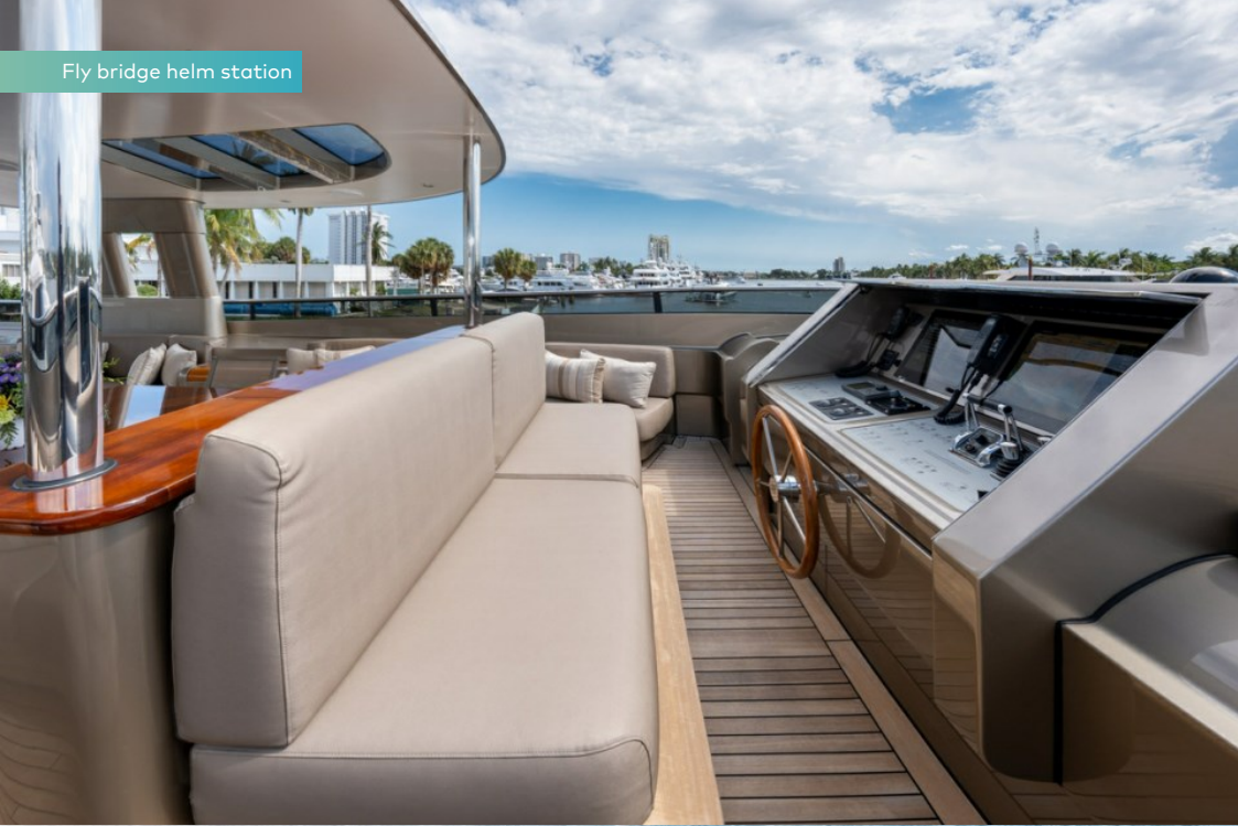
Fly bridge helm station