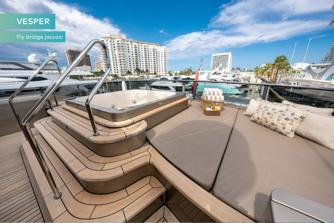
Fly bridge jacuzzi