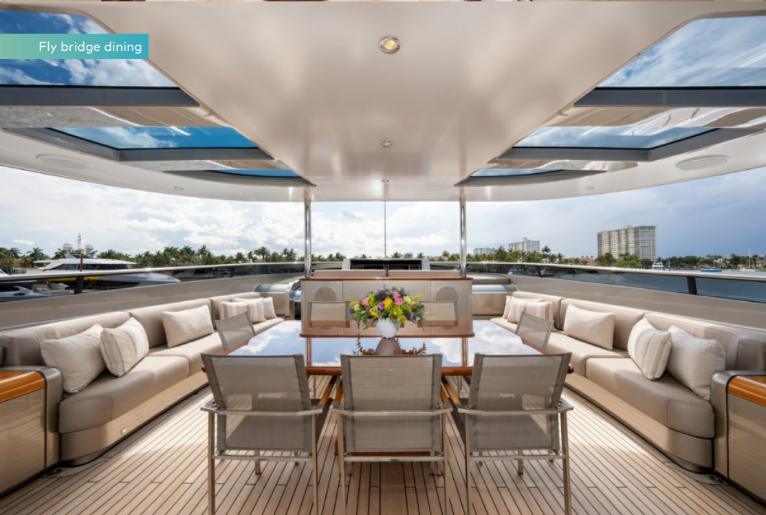
Fly bridge dining