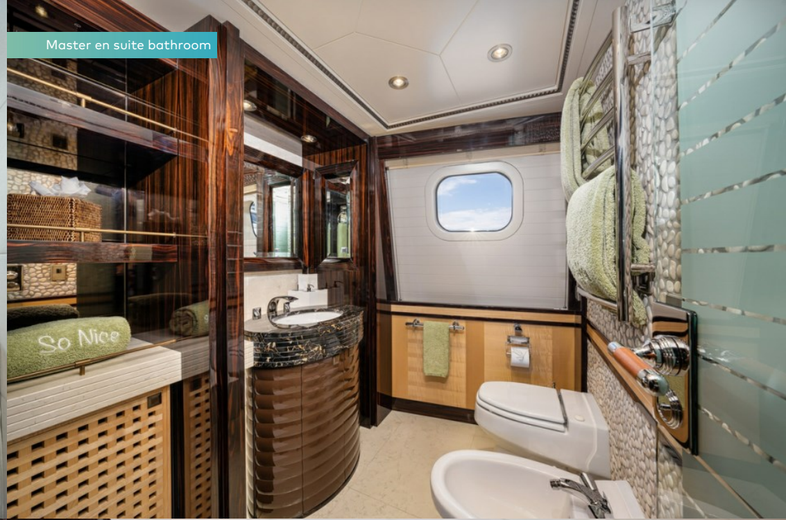
Master en suite bathroom