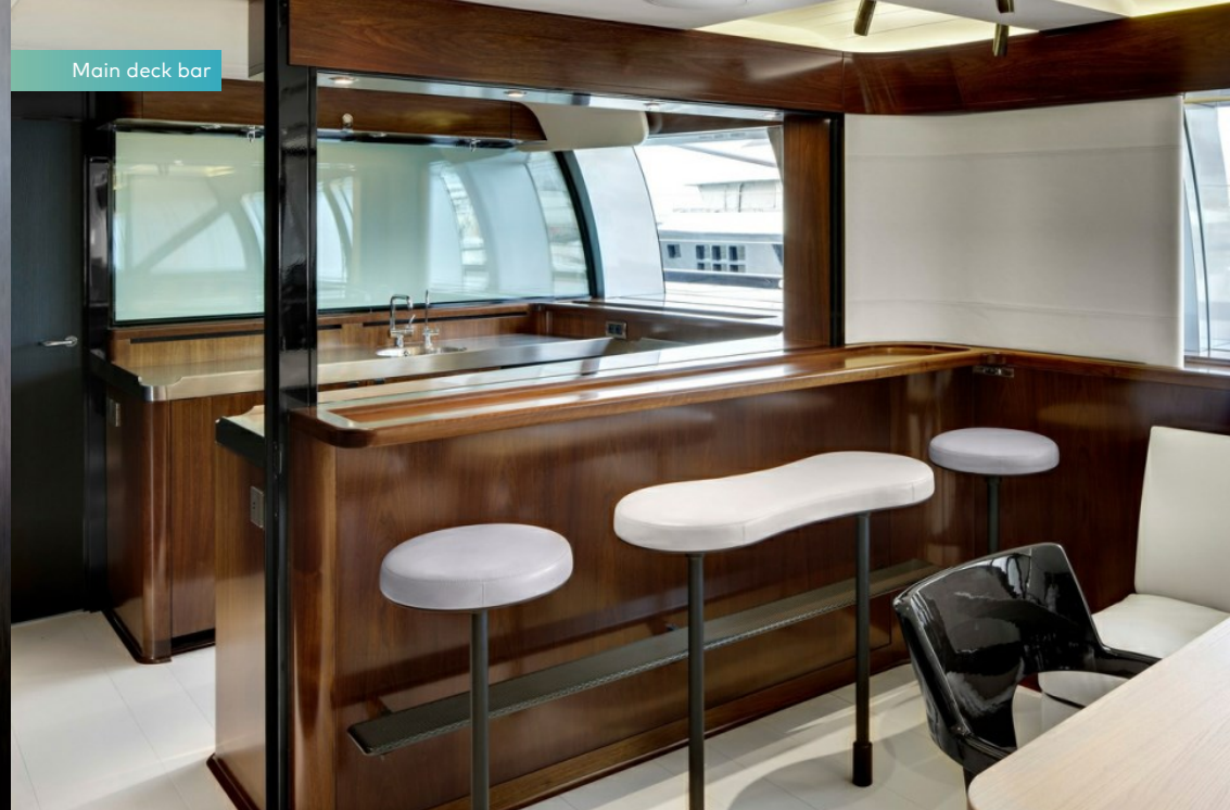
Main deck bar