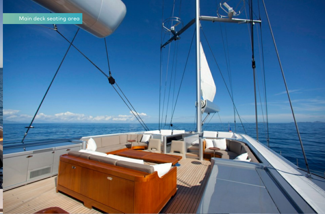
Main deck seating area