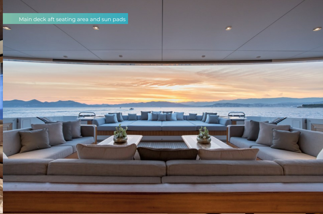
Main deck aft seating area and sun pads