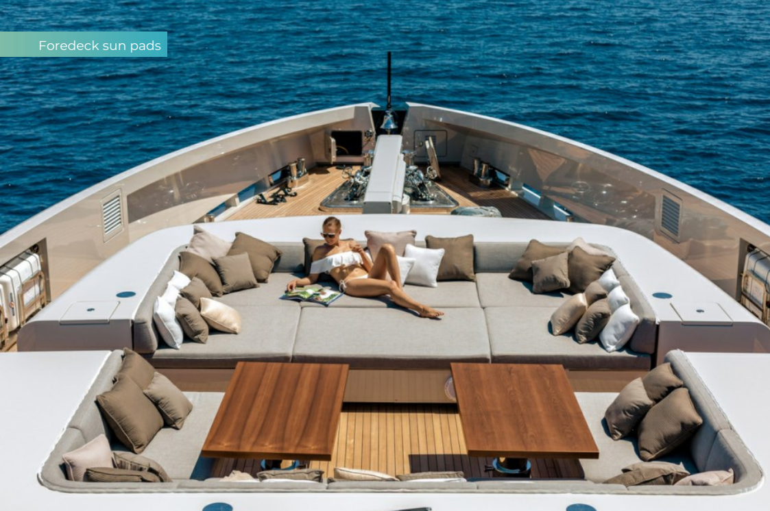
Foredeck sun pads