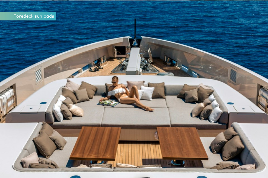
Foredeck sun pads