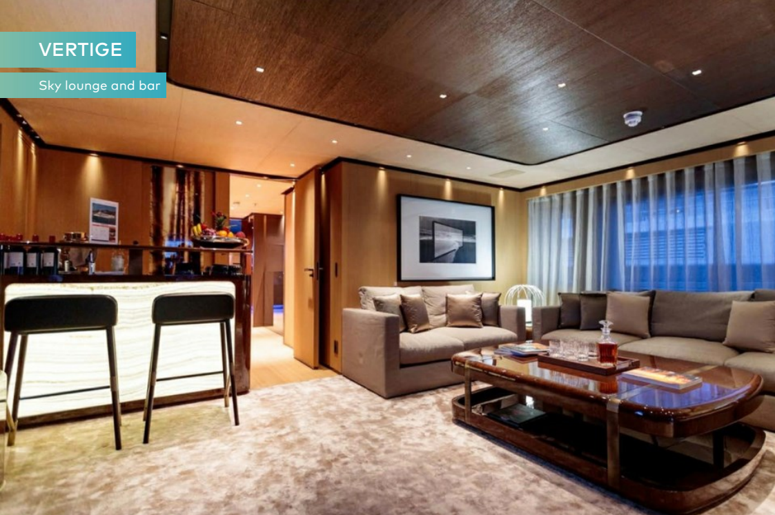
Sky lounge and bar