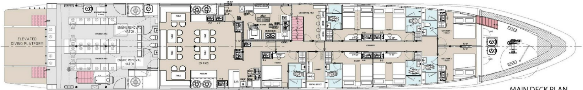
MAIN DECK PLAN