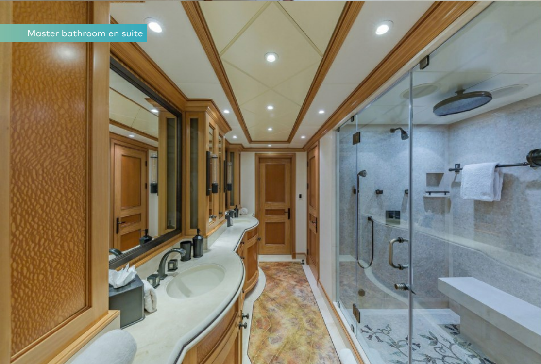
Master bathroom en suite