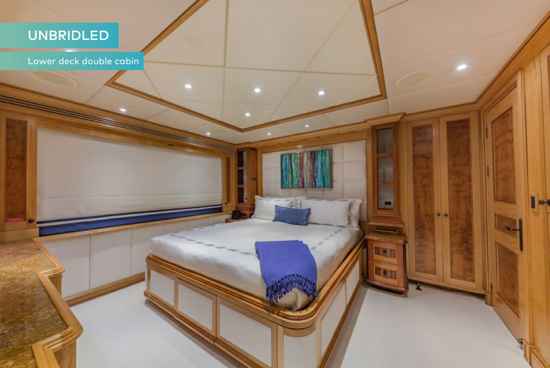
Lower deck double cabin