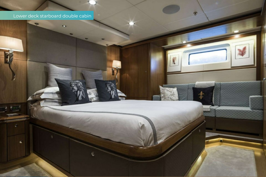
Lower deck starboard double cabin