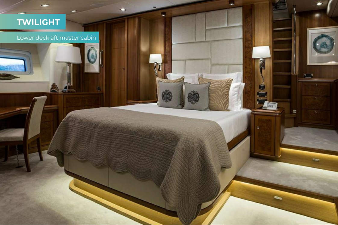
Lower deck aft master cabin