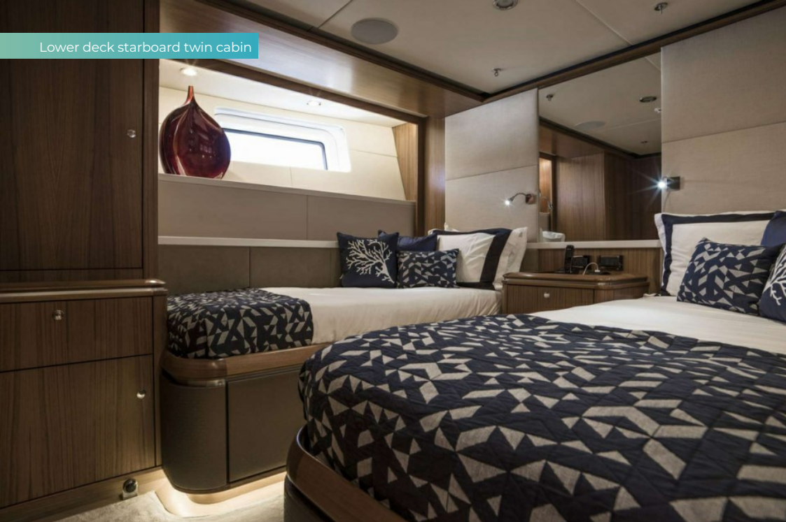
Lower deck starboard twin cabin