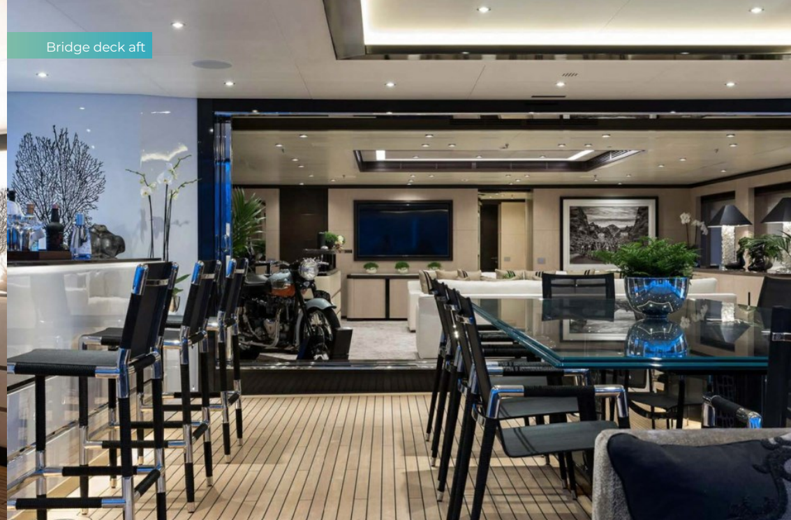
Bridge deck aft