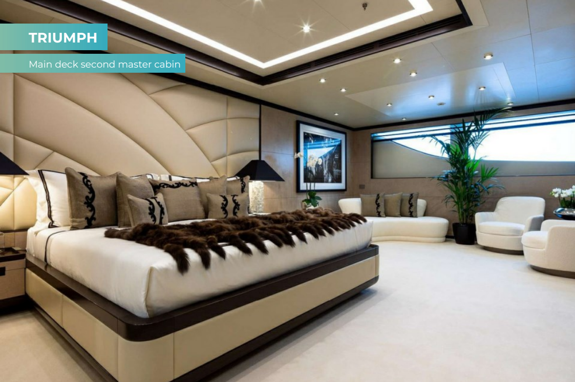
Main deck second master cabin