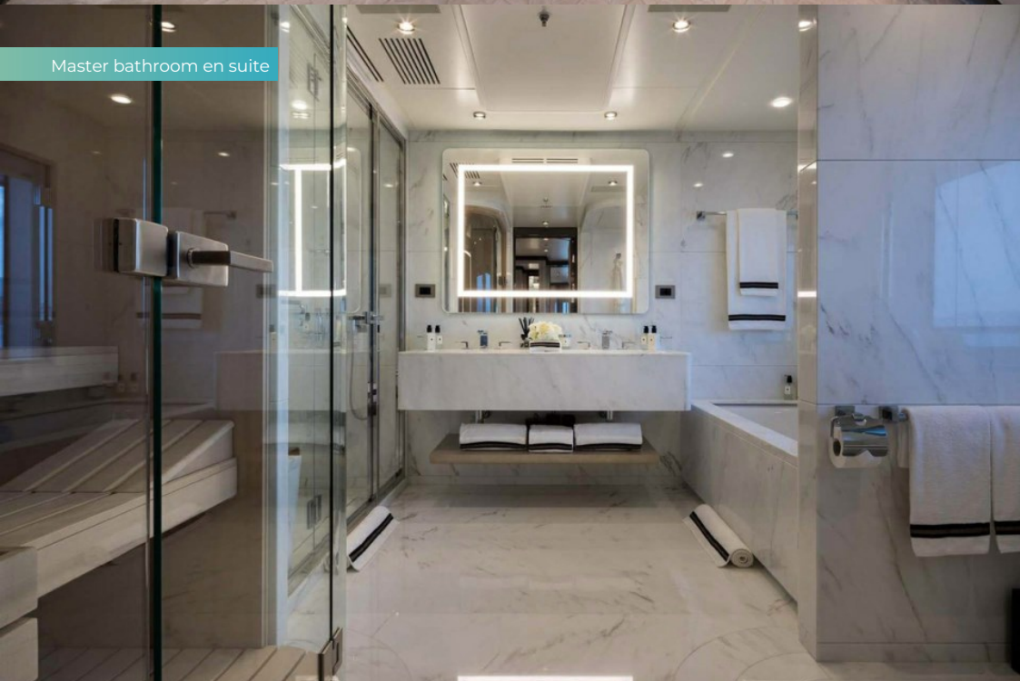
Master bathroom en suite