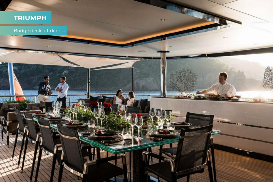
Bridge deck aft dining