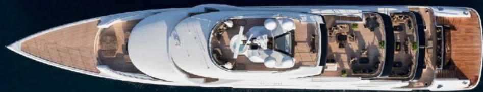
Sun deck jacuzzi