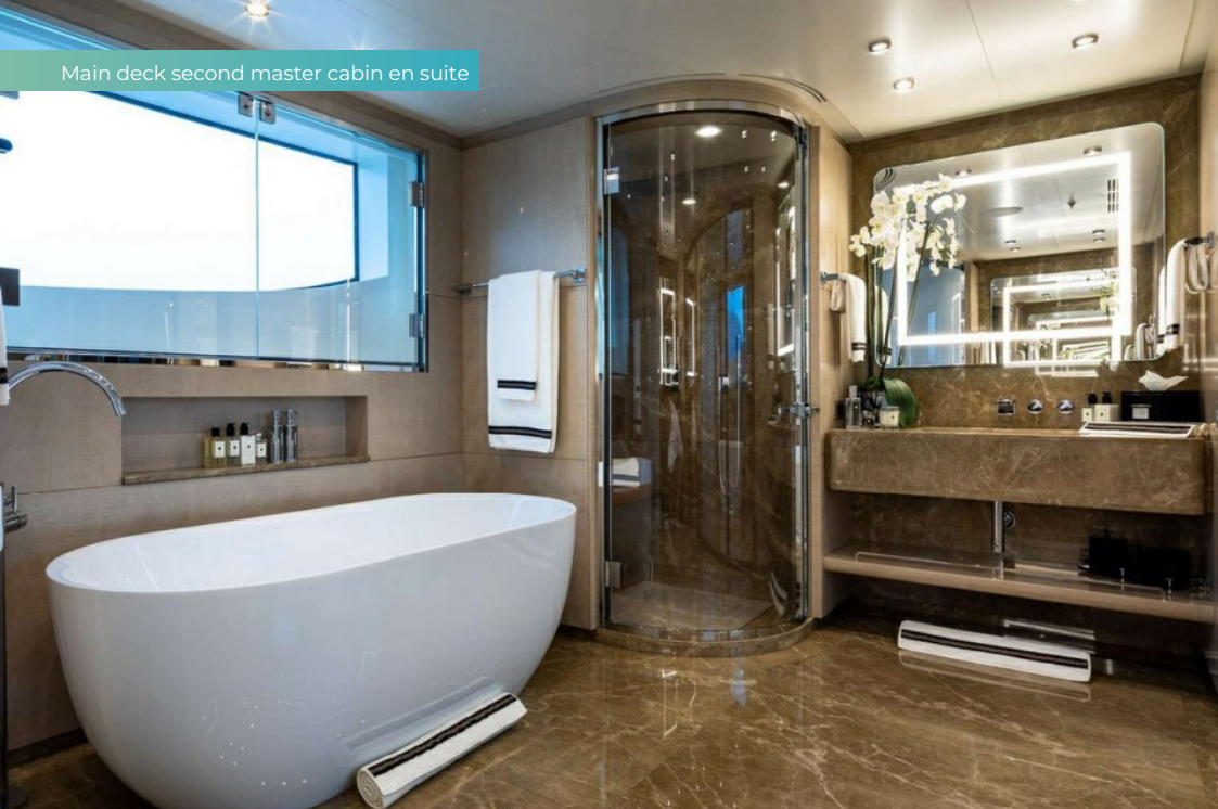
Main deck second master cabin en suite