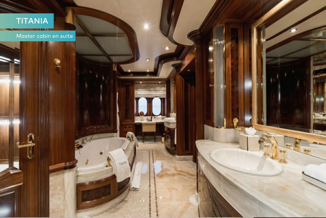
Master cabin en suite