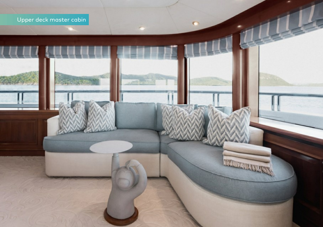
Upper deck master cabin