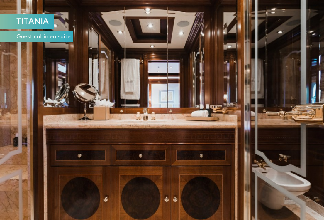
Guest cabin en suite