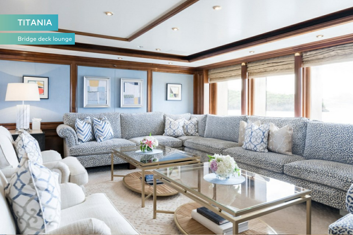
Bridge deck lounge