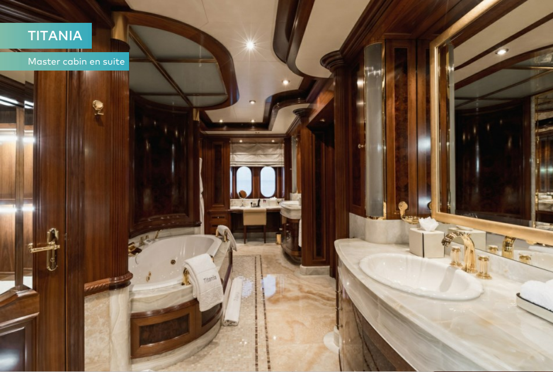
Master cabin en suite