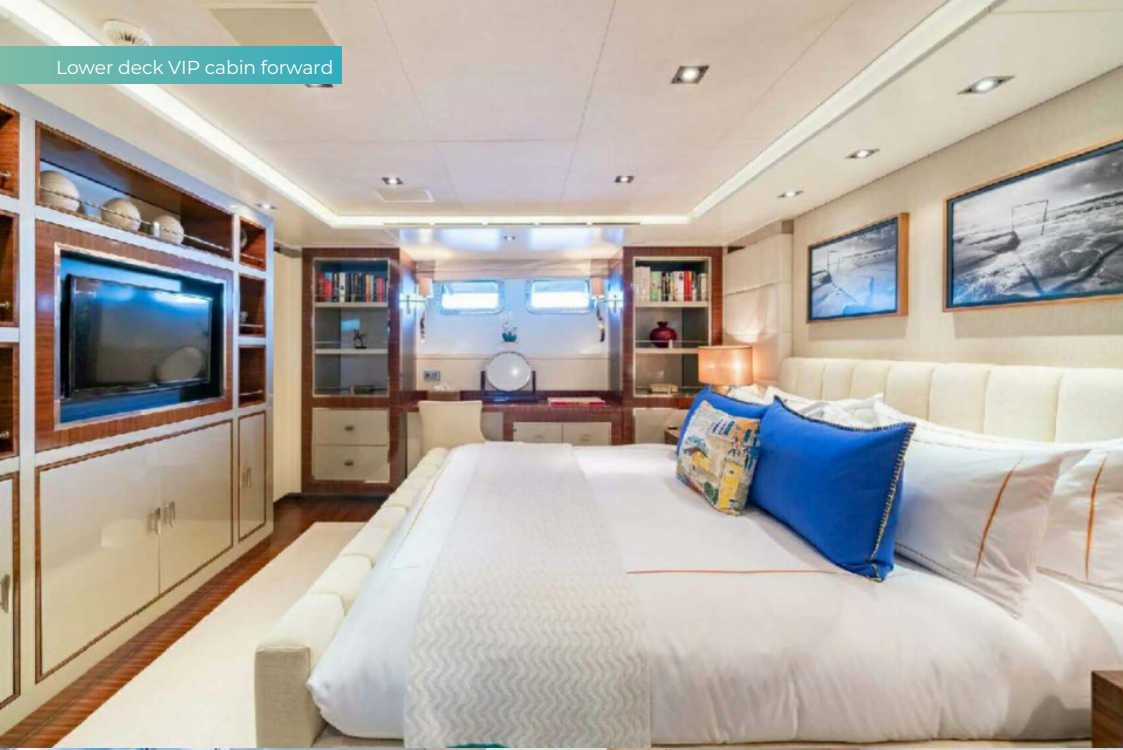
Lower deck VIP cabin forward