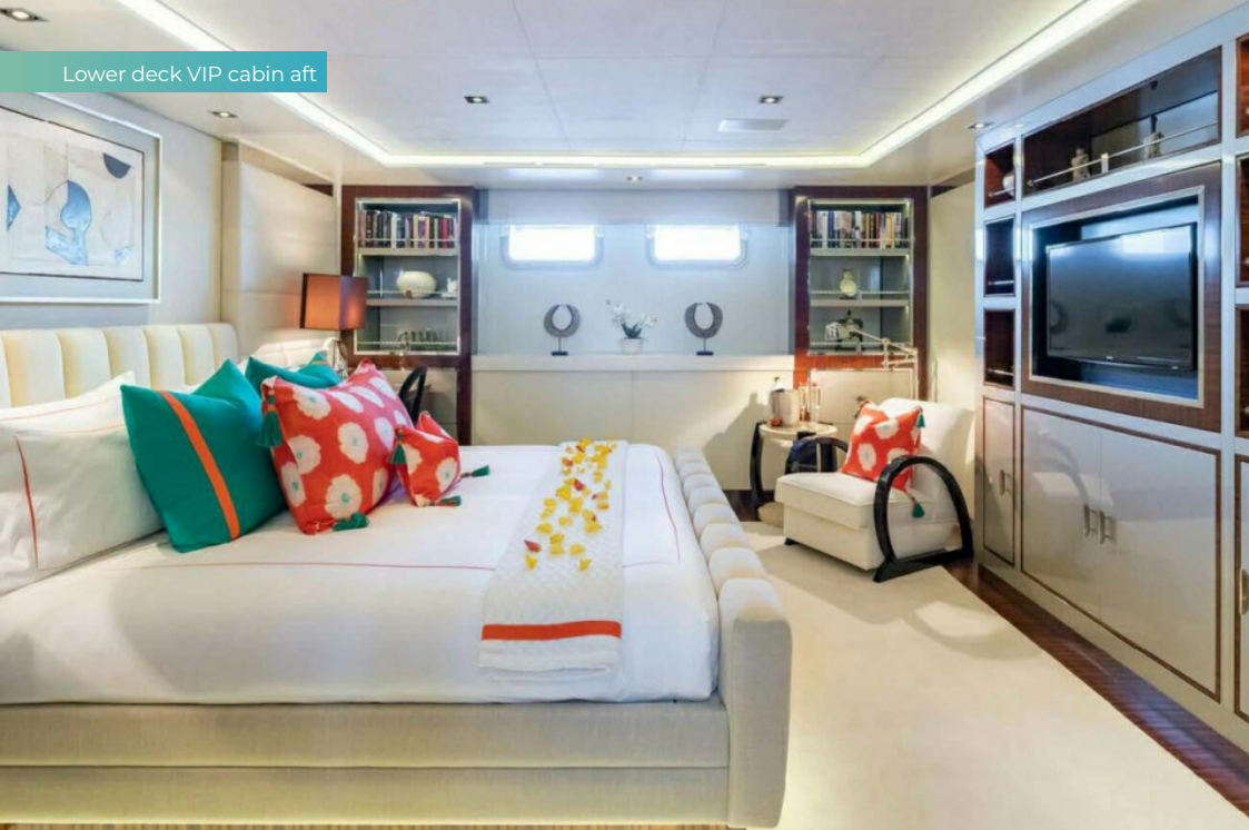
Lower deck VIP cabin aft