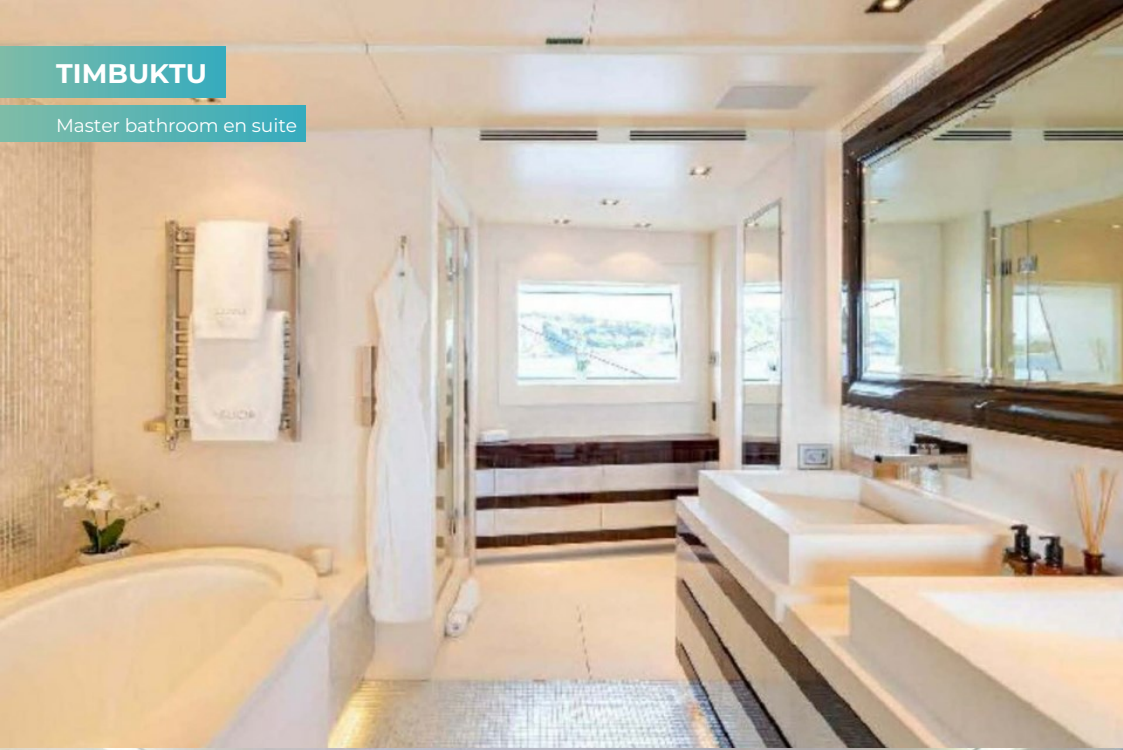
Master bathroom en suite