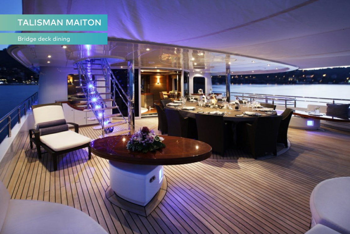
Bridge deck dining