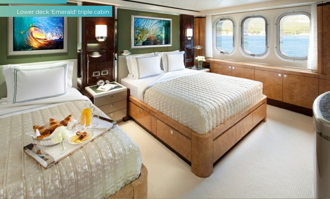
Lower deck 'Emerald' triple cabin