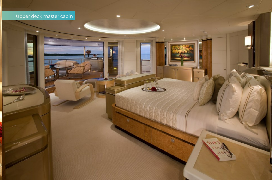
Upper deck master cabin