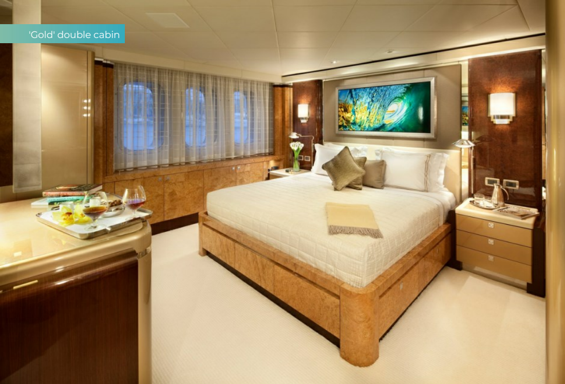
'Gold' double cabin