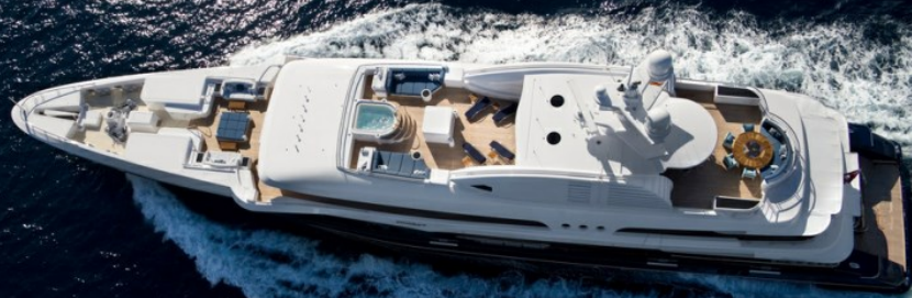
Sun deck jacuzzi