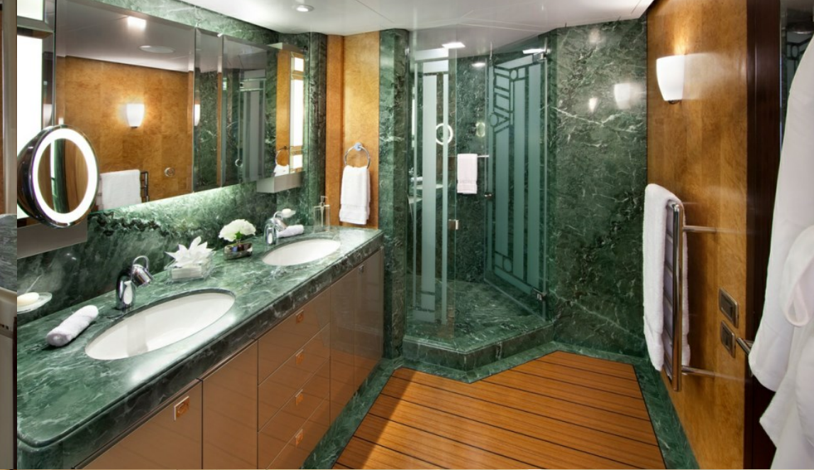
'Emerald' bathroom en suite