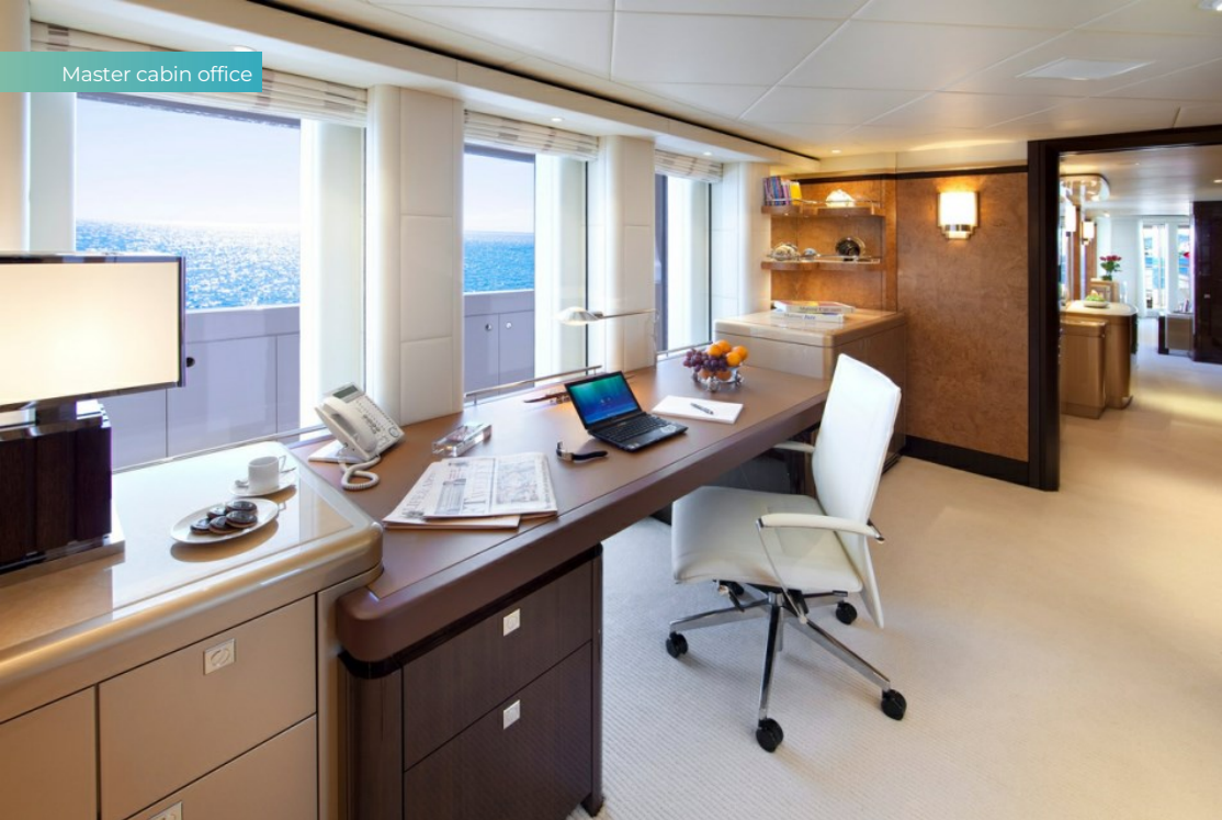
Master cabin office