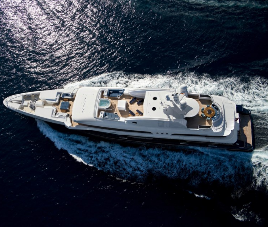
Sun deck jacuzzi