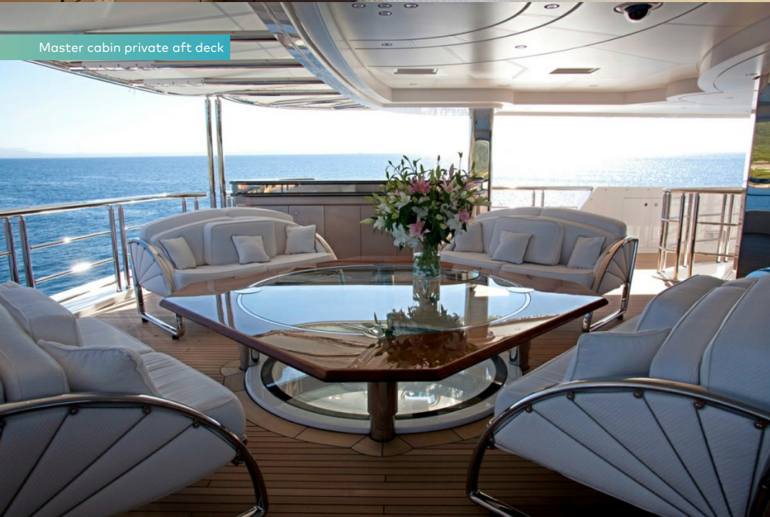
Master cabin private aft deck