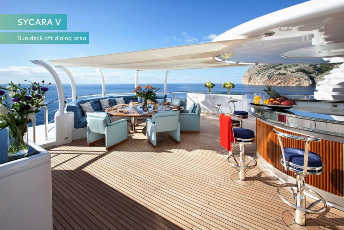
Sun deck aft dining area