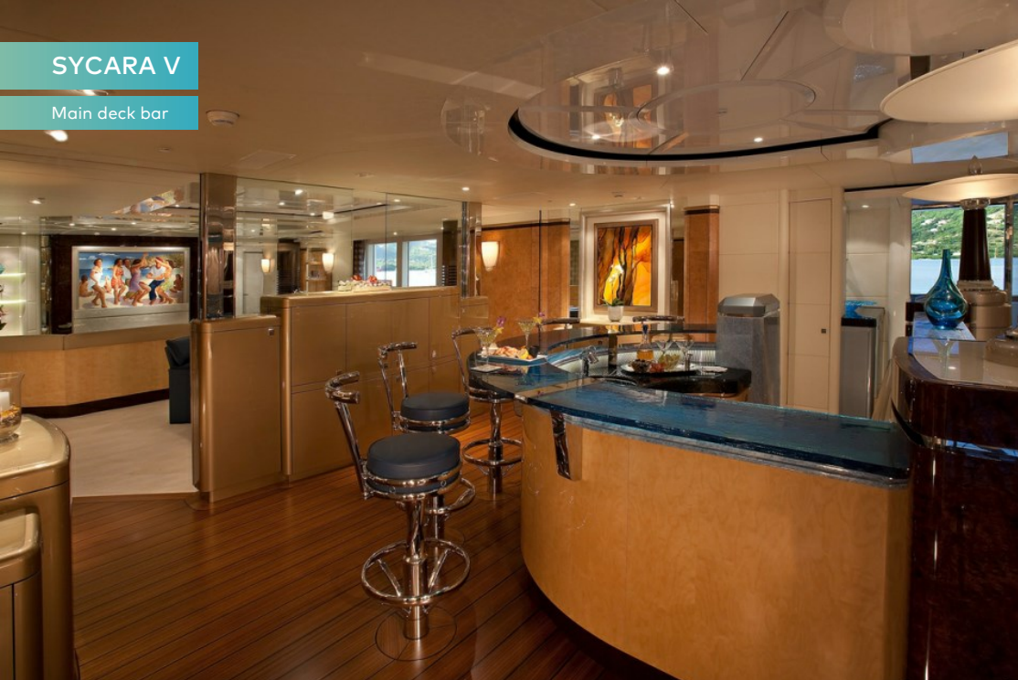
Main deck bar