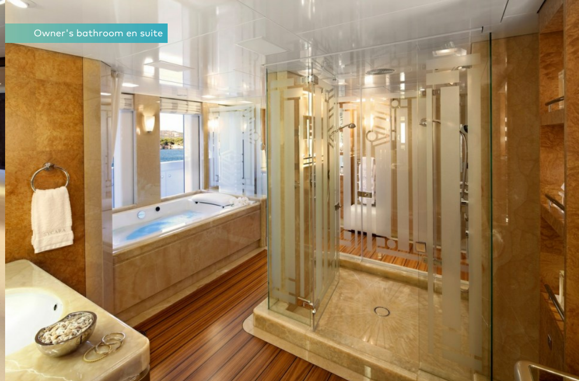
Owner's bathroom en suite