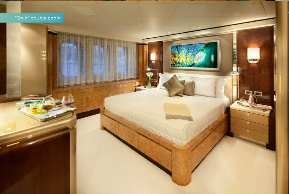
'Gold' double cabin