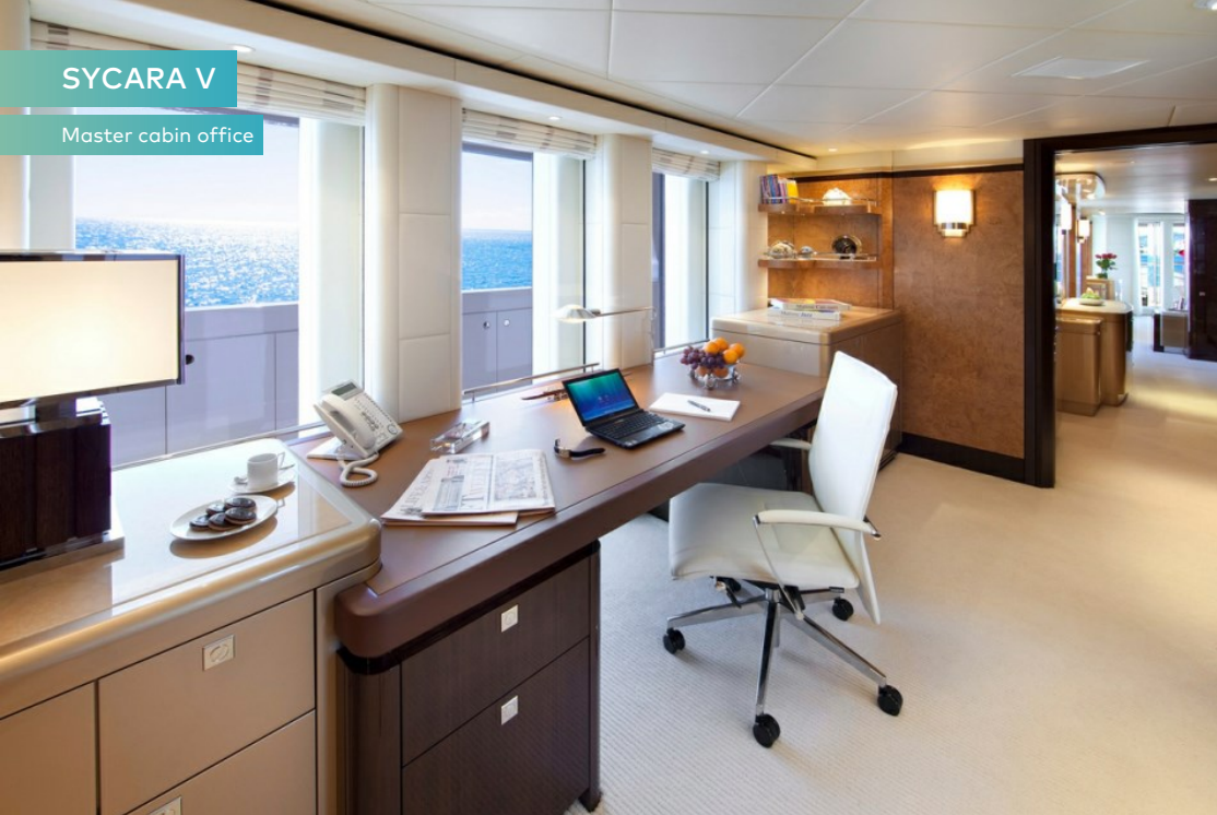
Master cabin office