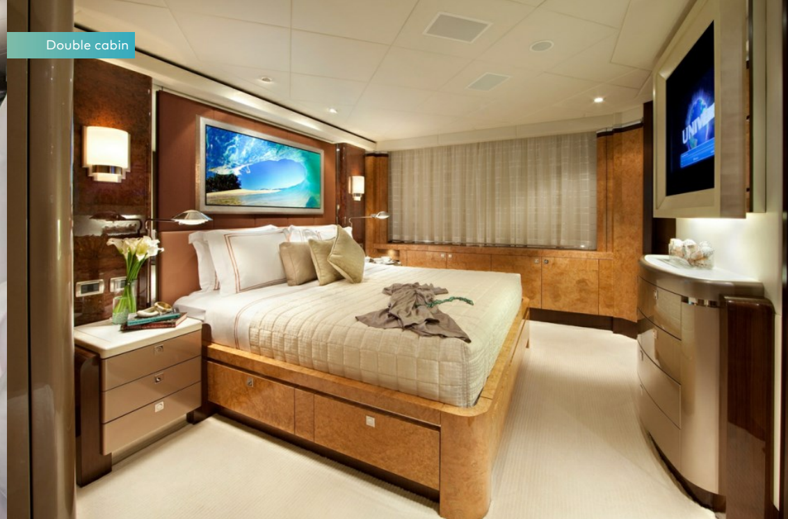
'Gold' double cabin