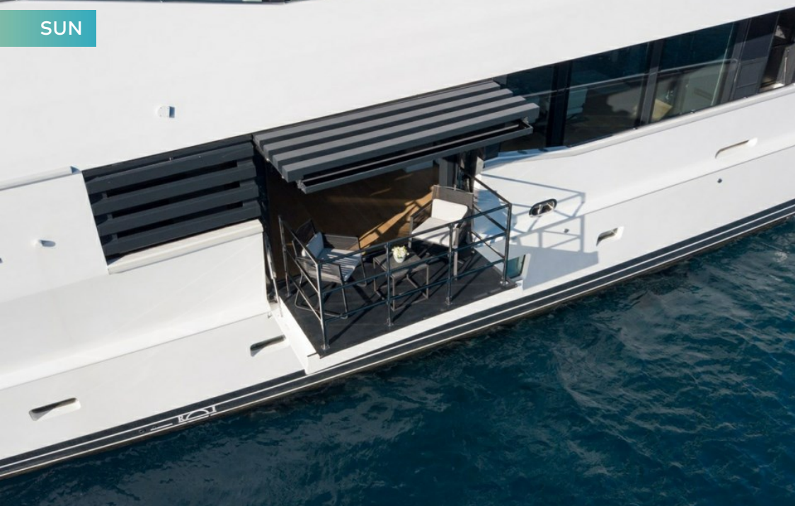
Main deck balcony