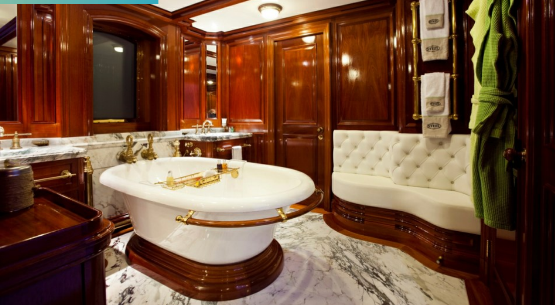
Owner's bathroom en suite