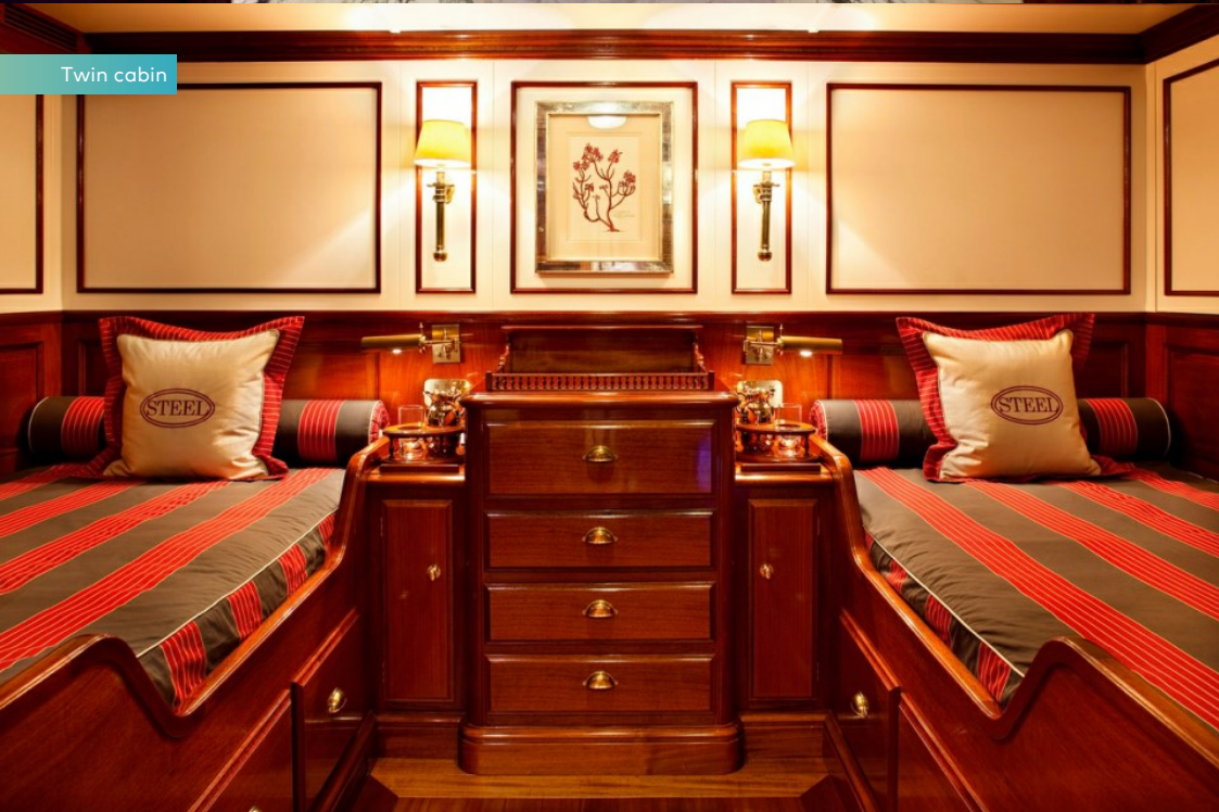
Lower deck single staff cabin