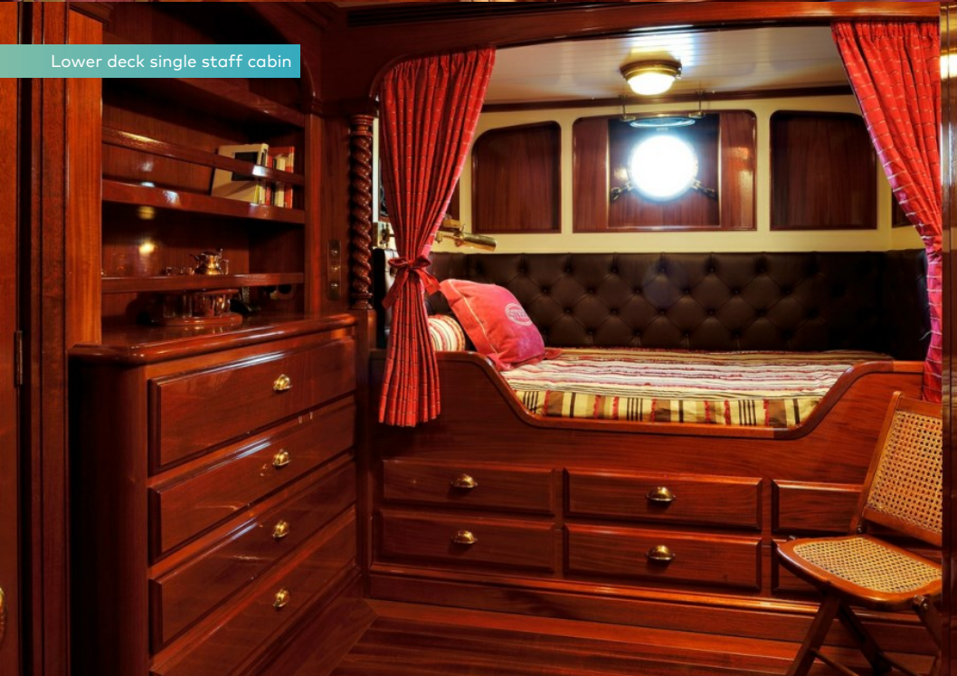
Lower deck single staff cabin