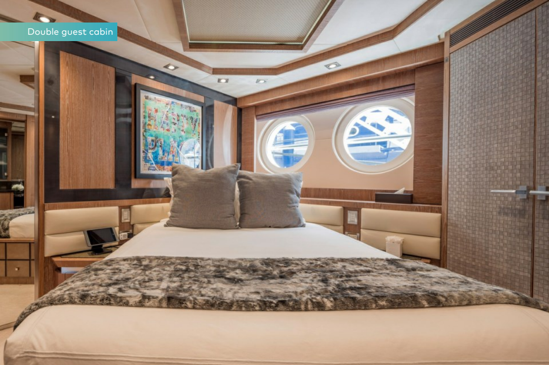
Double guest cabin