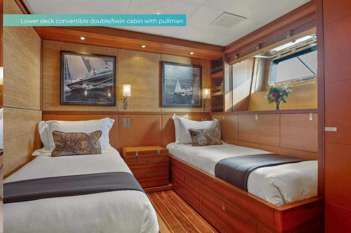
Lower deck convertible double/twin cabin with pullman