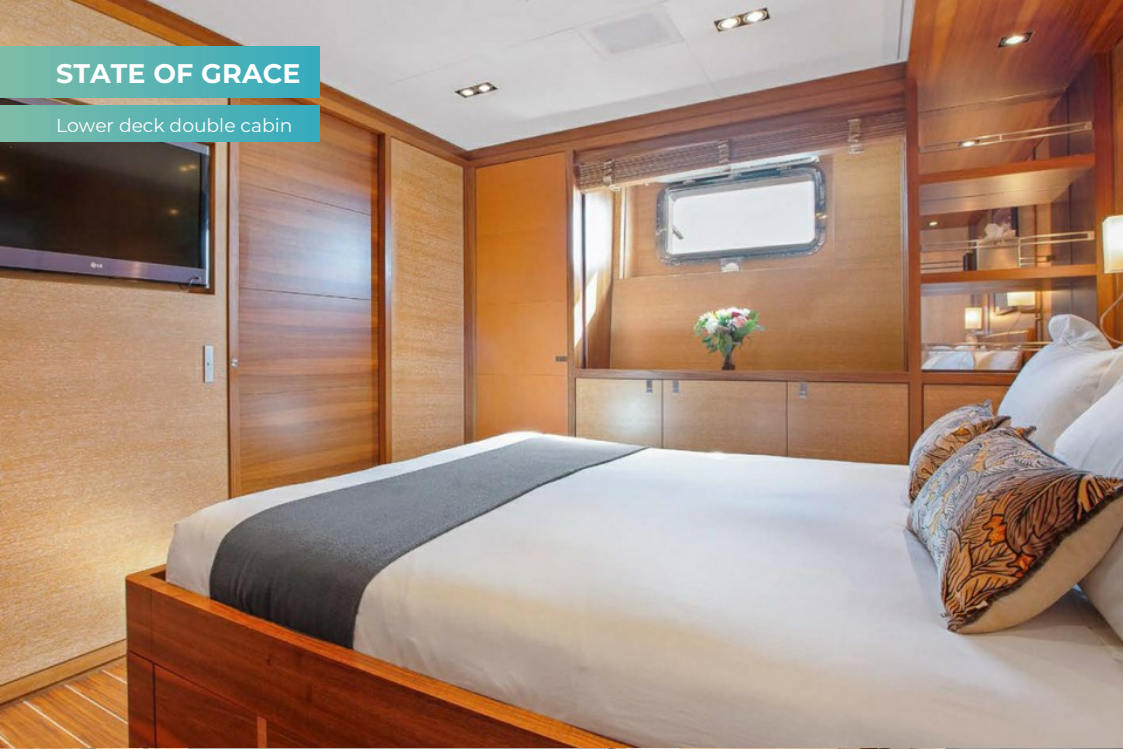
Lower deck double cabin