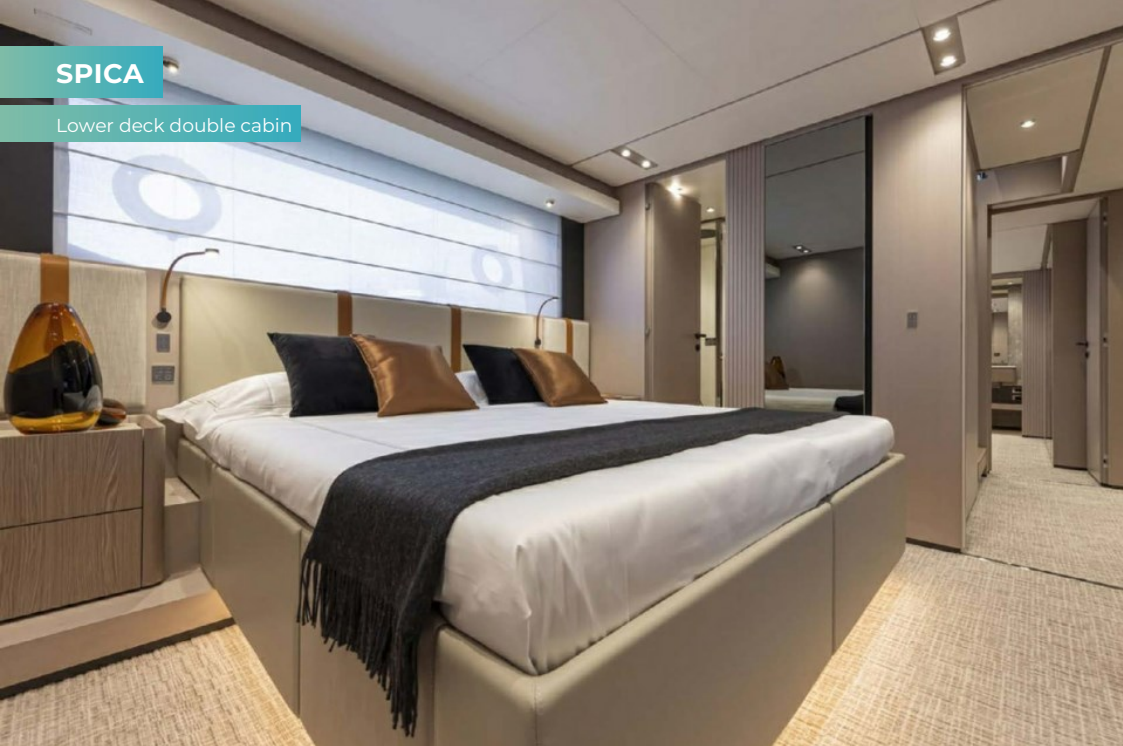
Lower deck double cabin