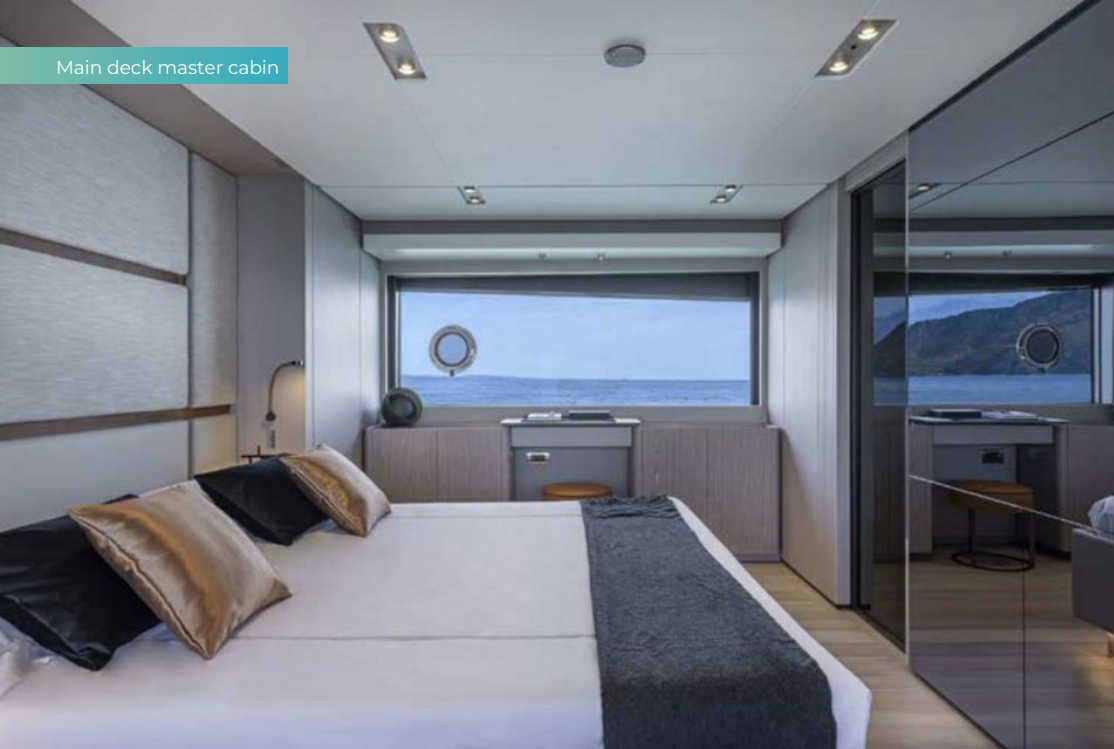
Main deck master cabin