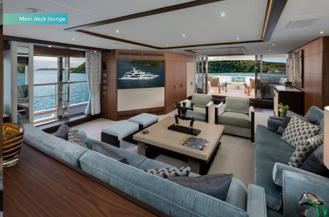
Main deck lounge