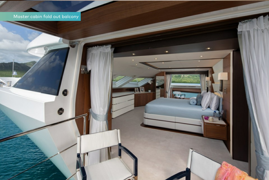
Master cabin fold out balcony