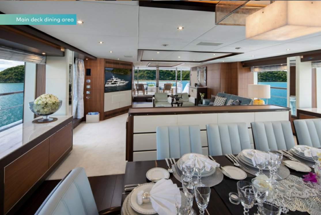
Main deck dining area