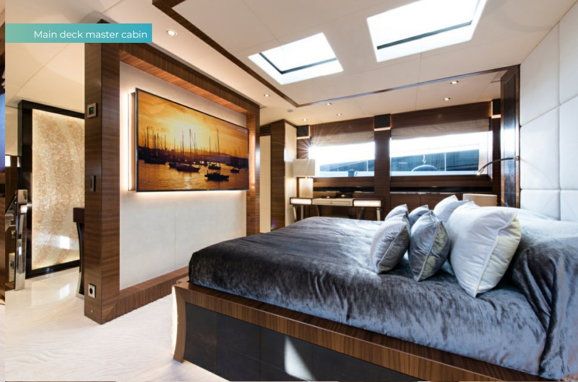
Main deck master cabin