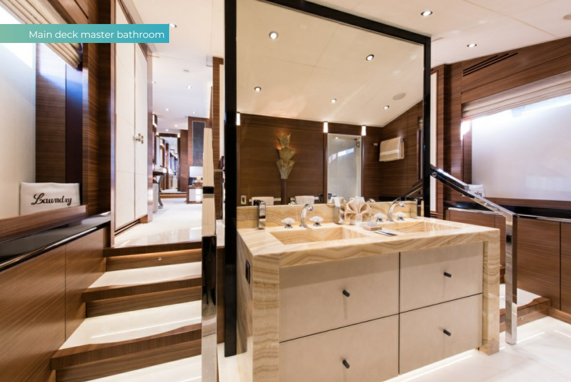
Main deck master bathroom