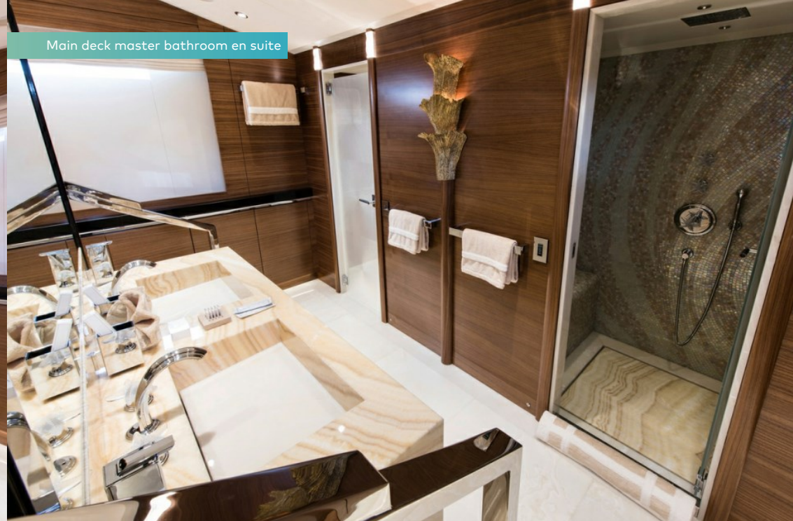
Main deck master bathroom en suite