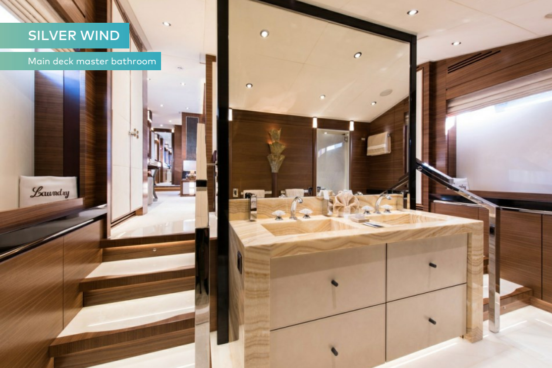
Main deck master bathroom