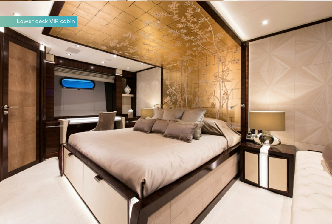
Lower deck VIP cabin