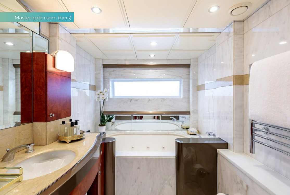
Master bathroom (hers)