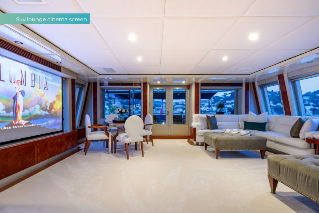
Sky lounge cinema screen