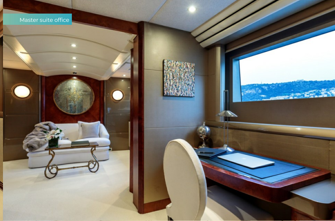
Master suite office