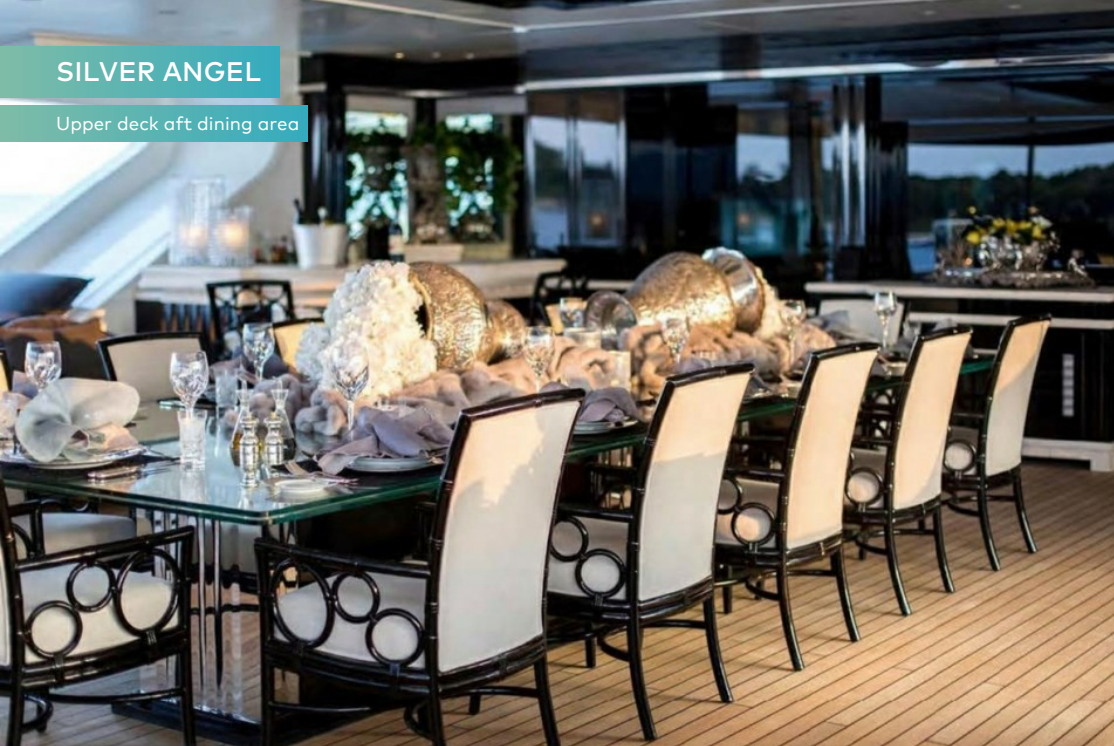
Upper deck aft dining area