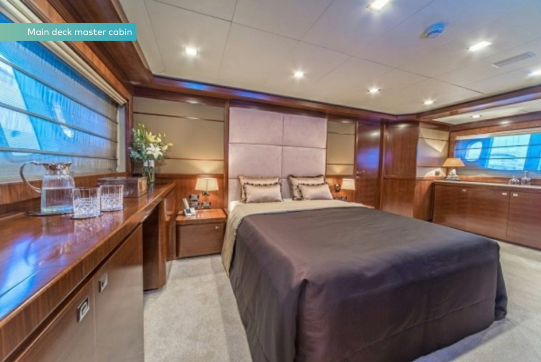
Main deck master cabin