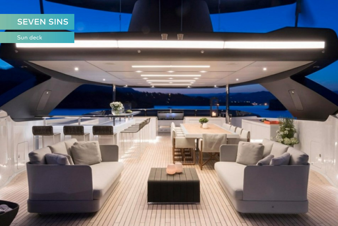
Upper deck aft dining area