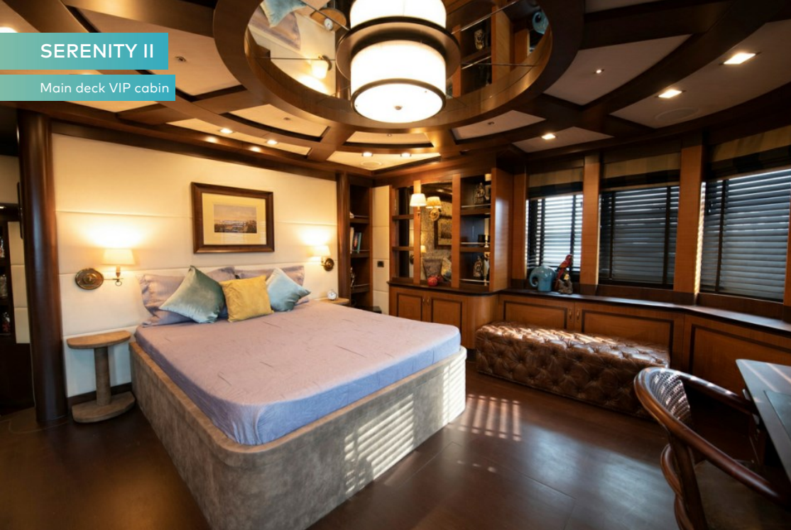
Main deck VIP cabin