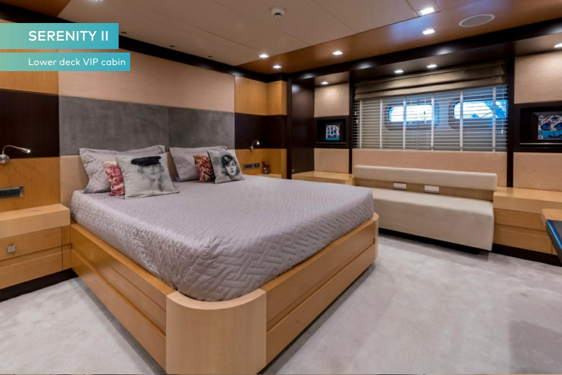
Lower deck VIP cabin