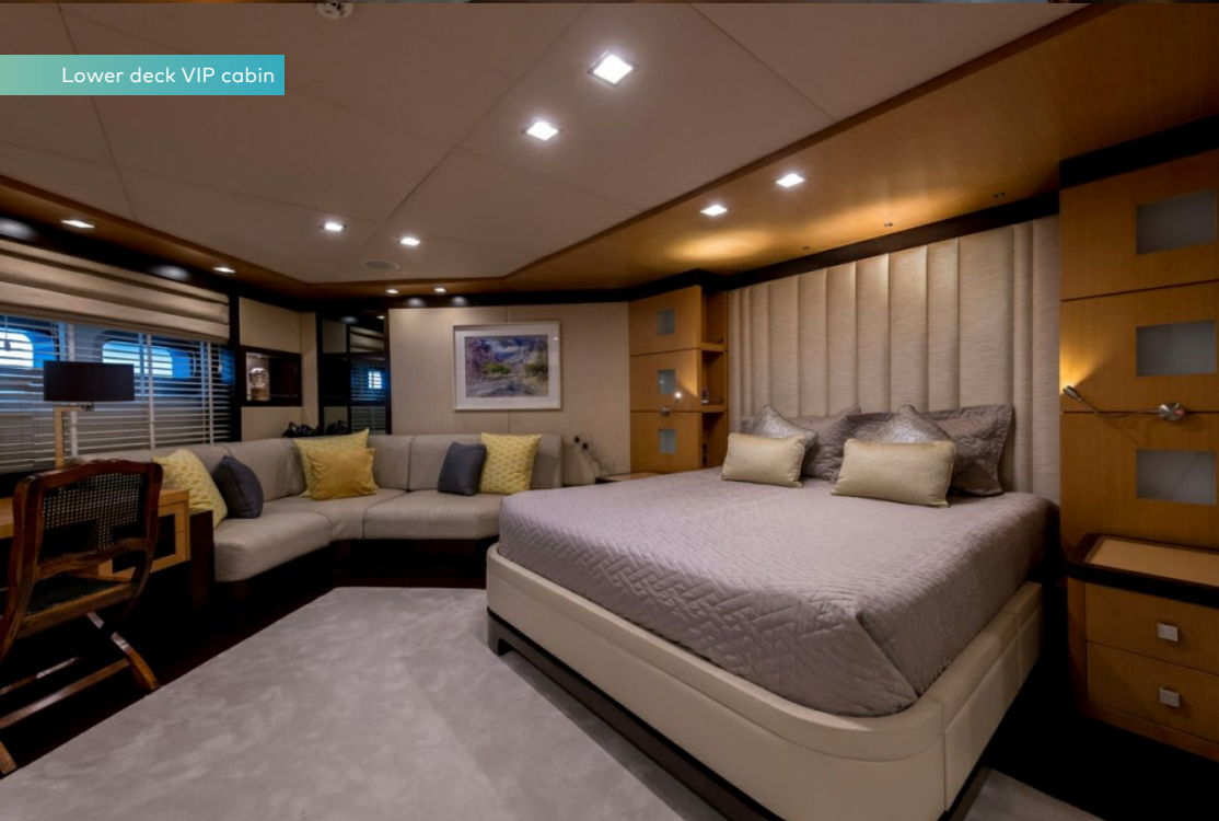
Lower deck VIP cabin