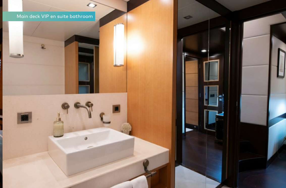
Main deck VIP en suite bathroom