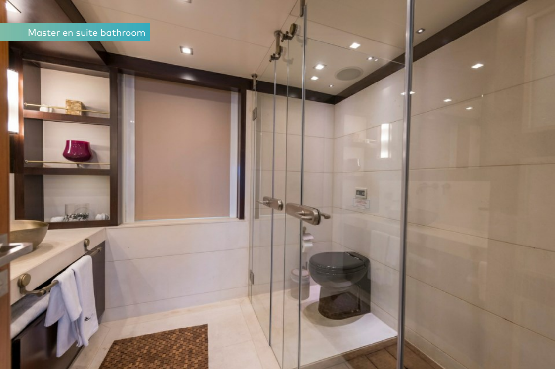
Master en suite bathroom