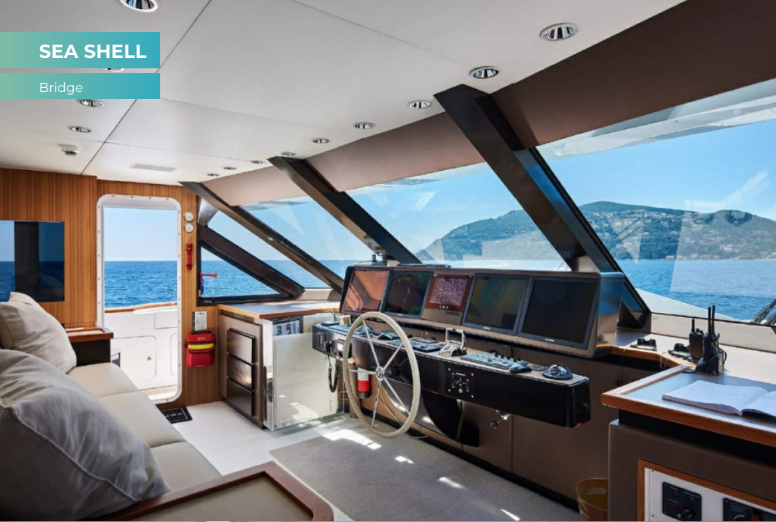
Bridge deck aft