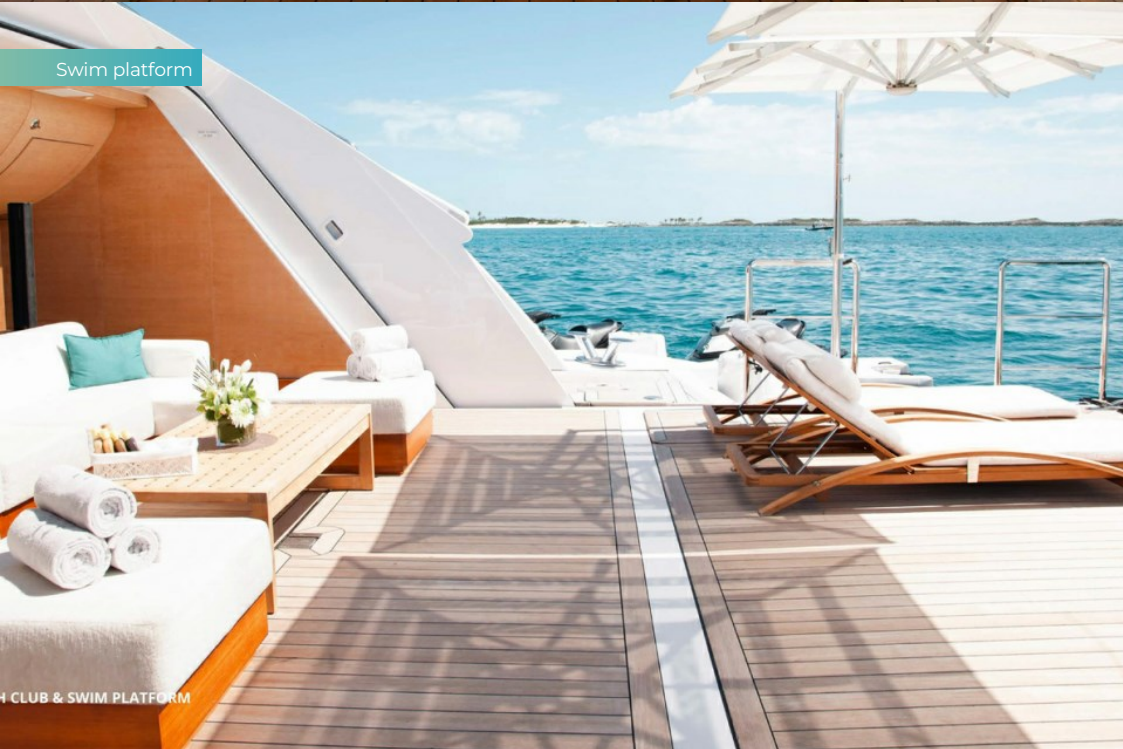
MAIN DECK CLUB & SWIM PLATFORM