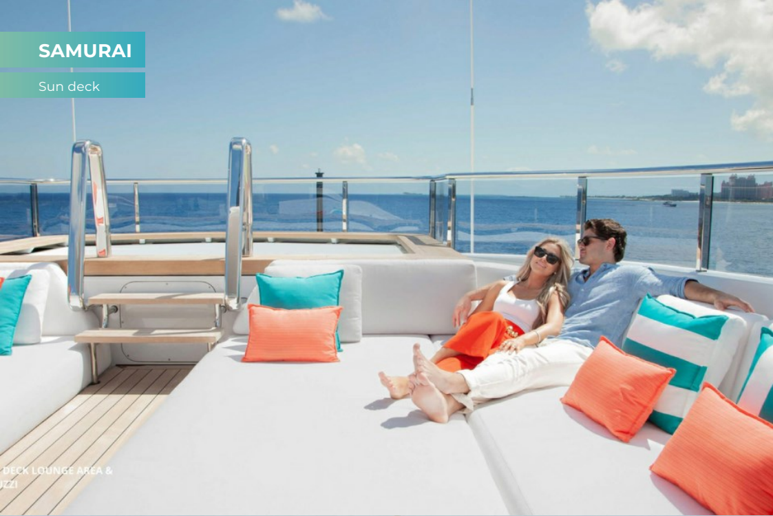
DECK LOUNGE AREA & JUZZI