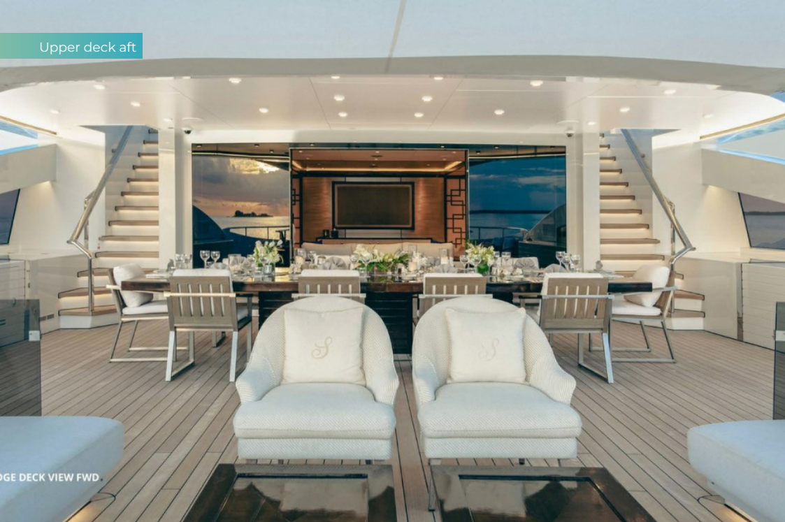
DECK VIEW FWD.