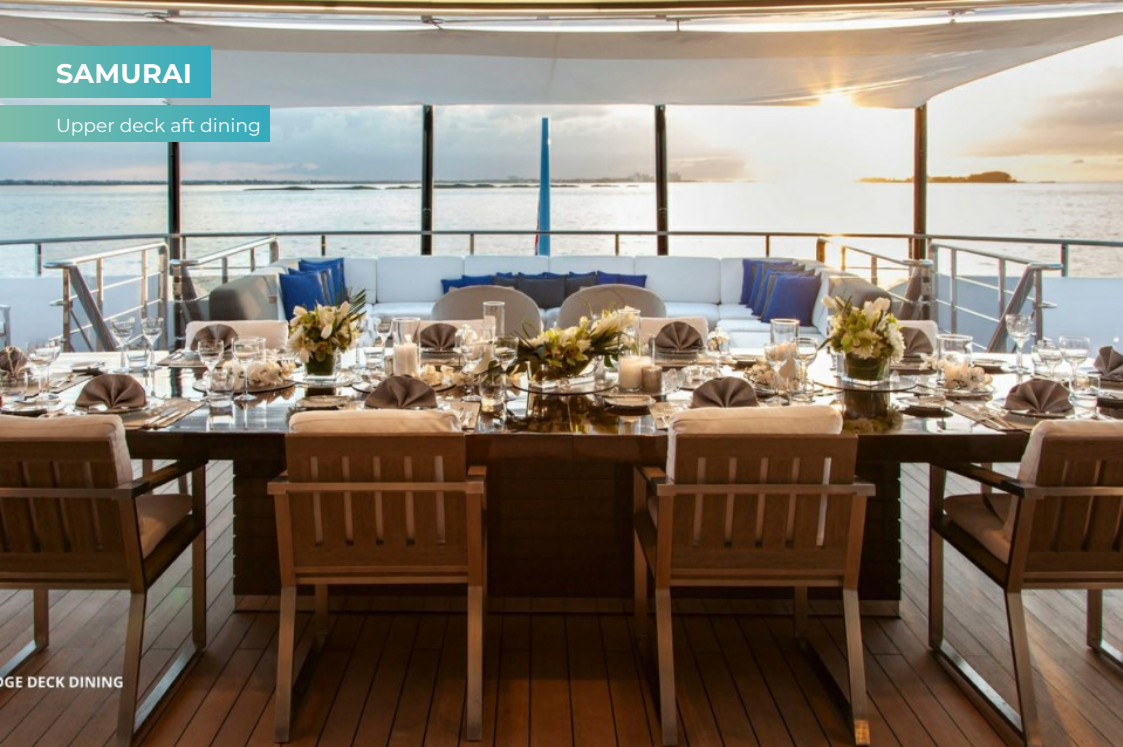
UPPER DECK DINING