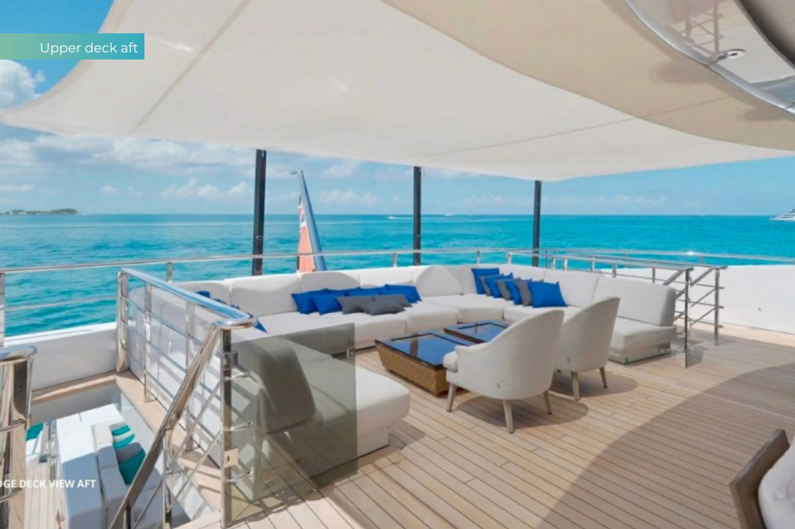
DECK VIEW AFT