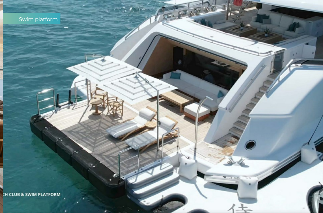
MAIN DECK CLUB & SWIM PLATFORM