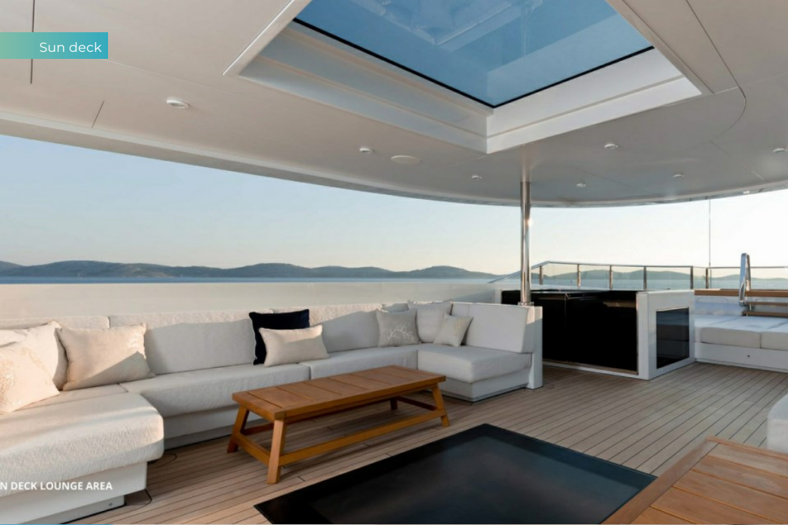
DECK LOUNGE AREA