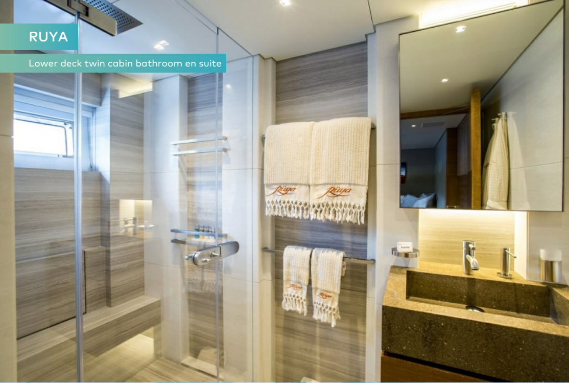
Lower deck twin cabin bathroom en suite