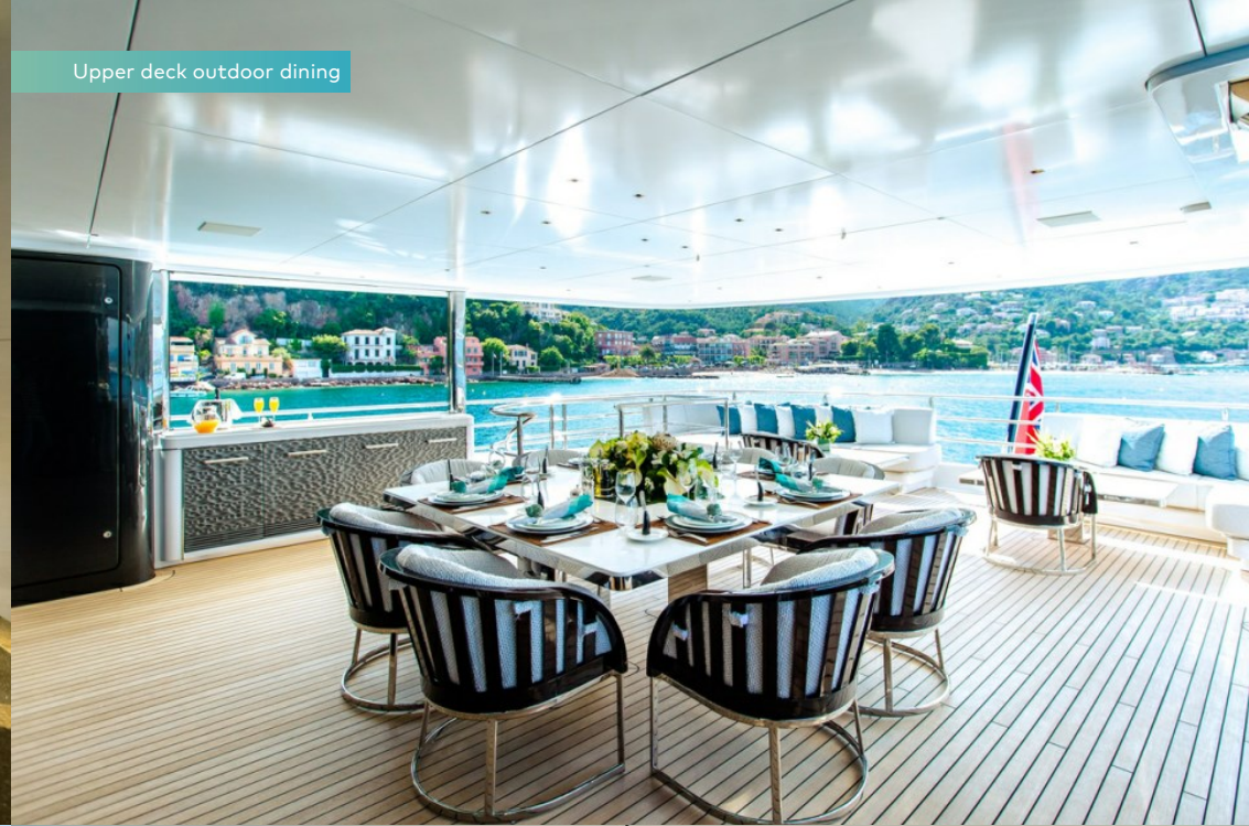
Upper deck outdoor dining