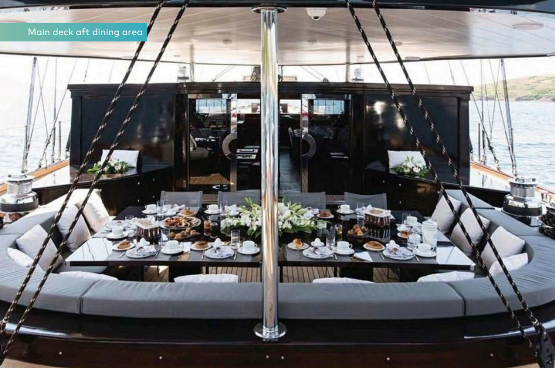
Main deck aft dining area