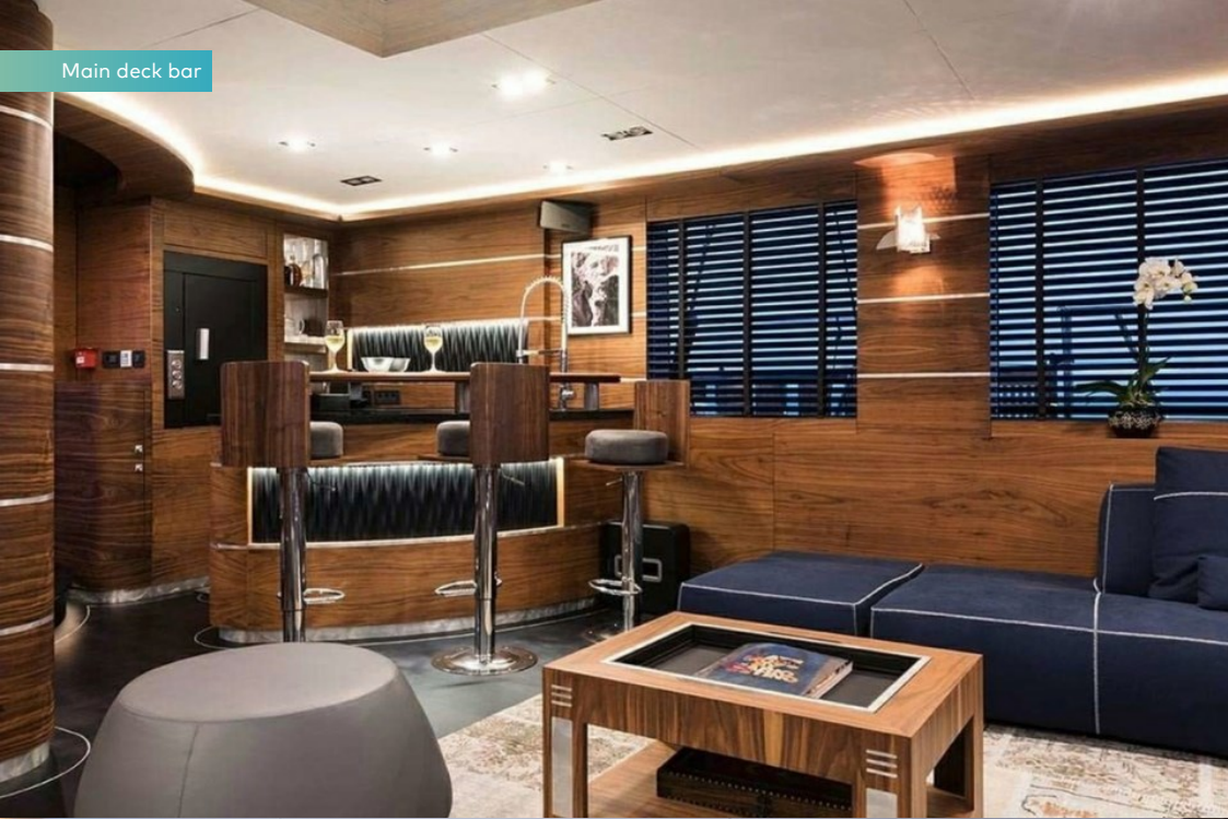
Main deck bar