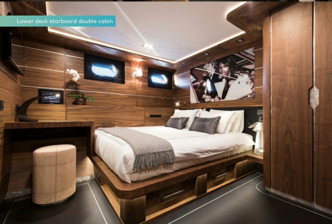
Lower deck starboard double cabin