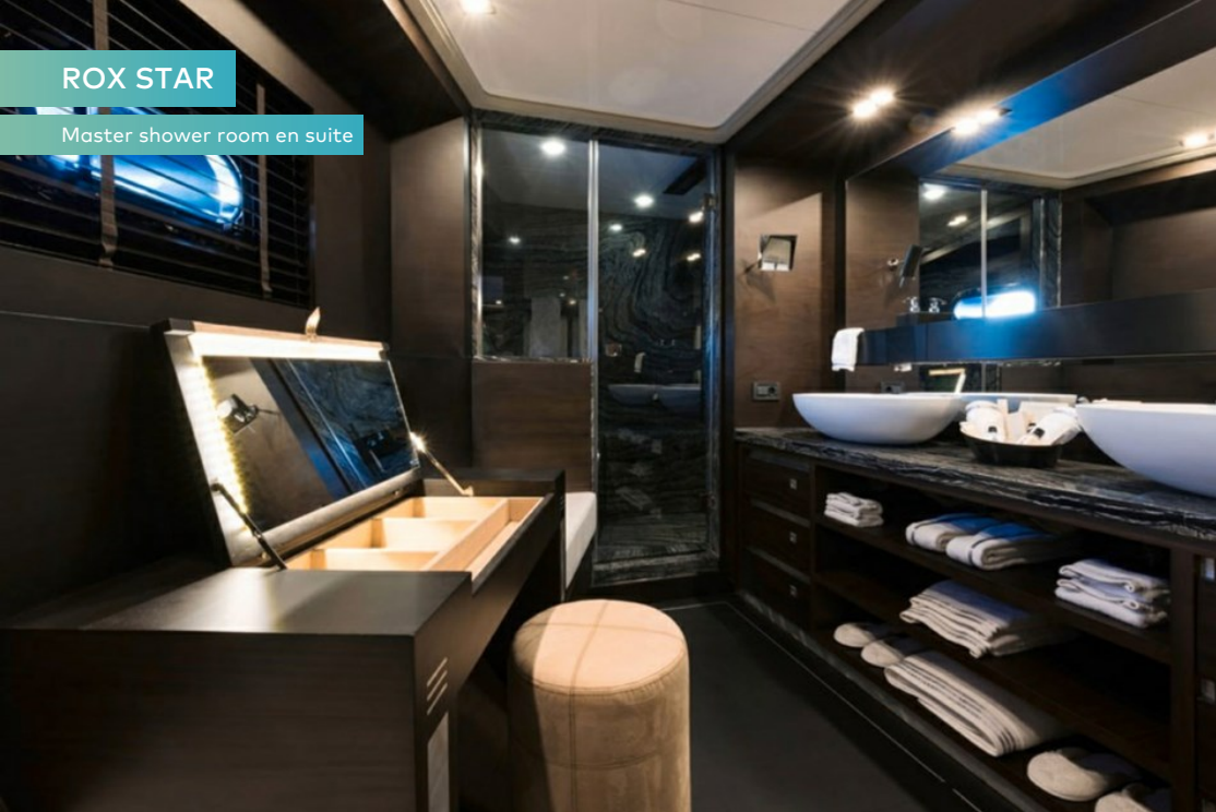
Master shower room en suite