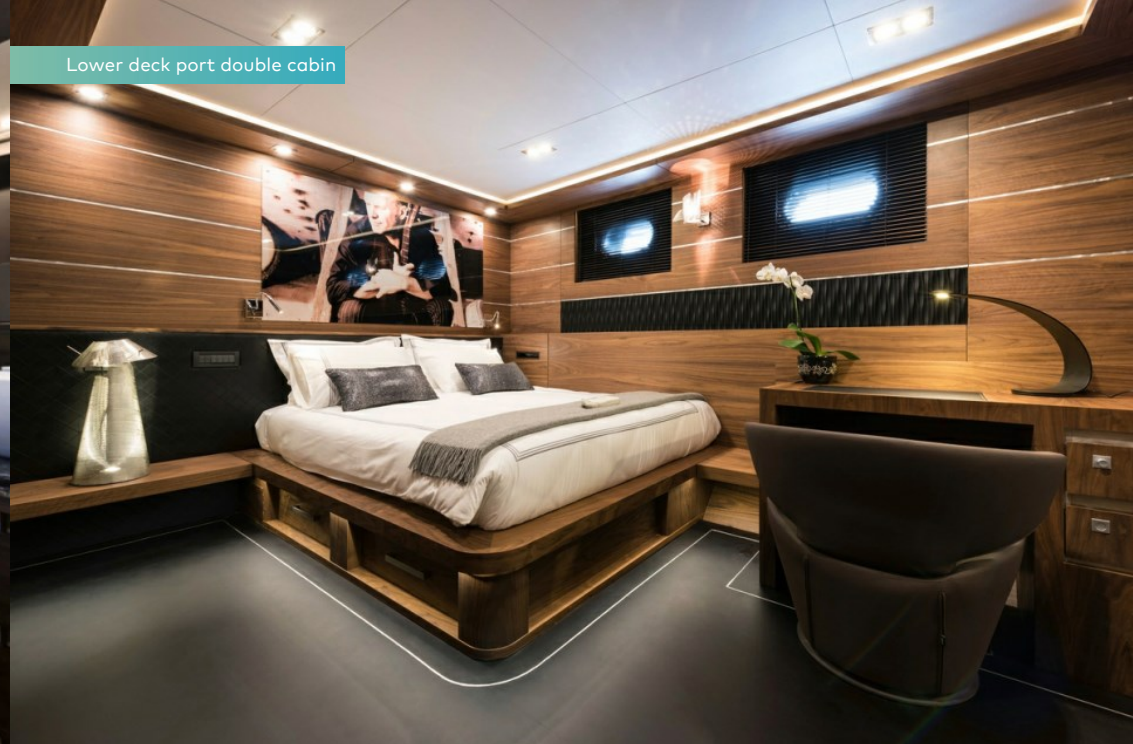
Lower deck port double cabin