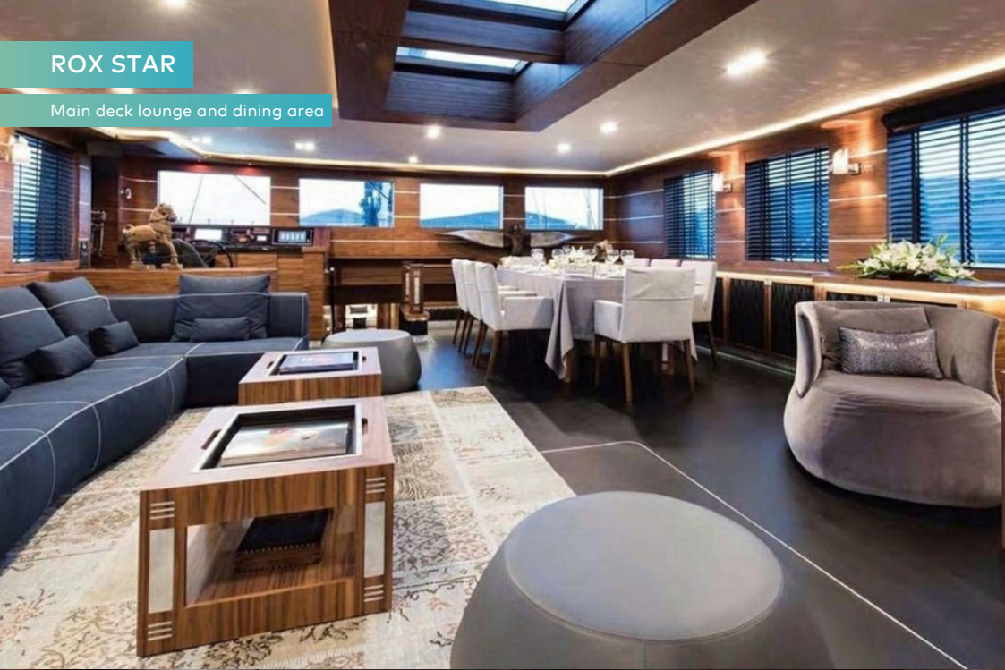
Main deck lounge and dining area