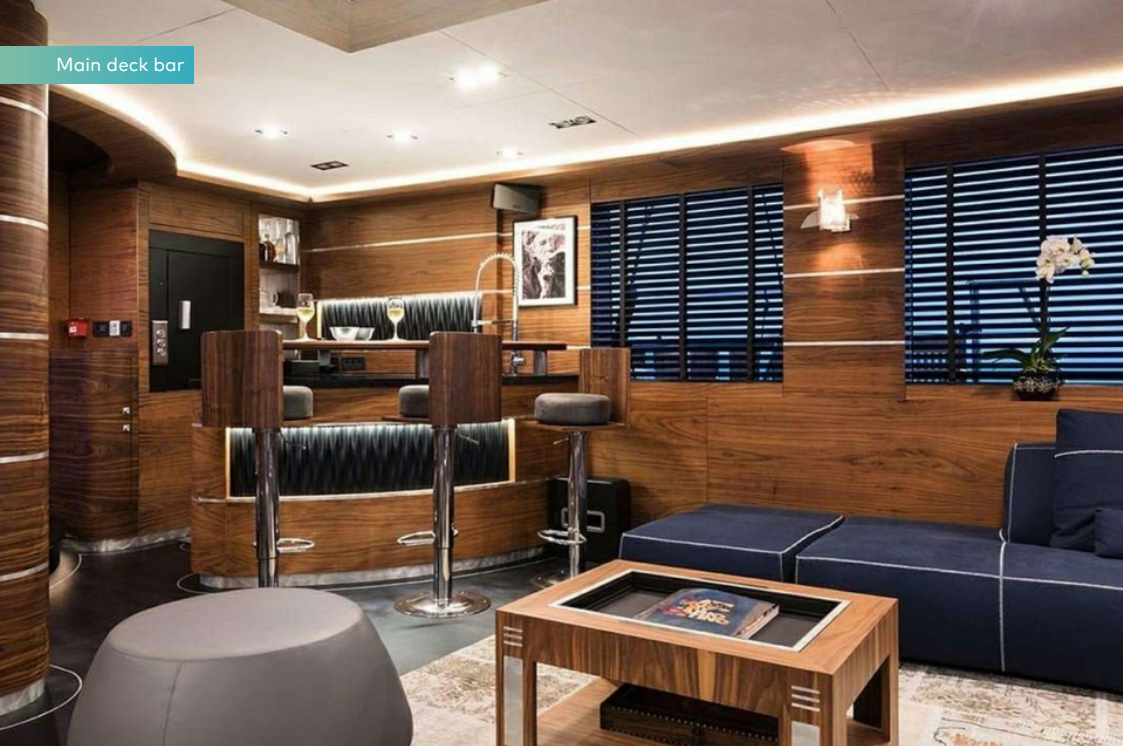
Main deck bar