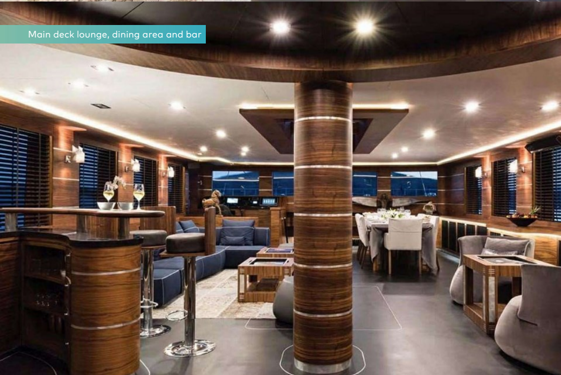
Main deck lounge, dining area and bar