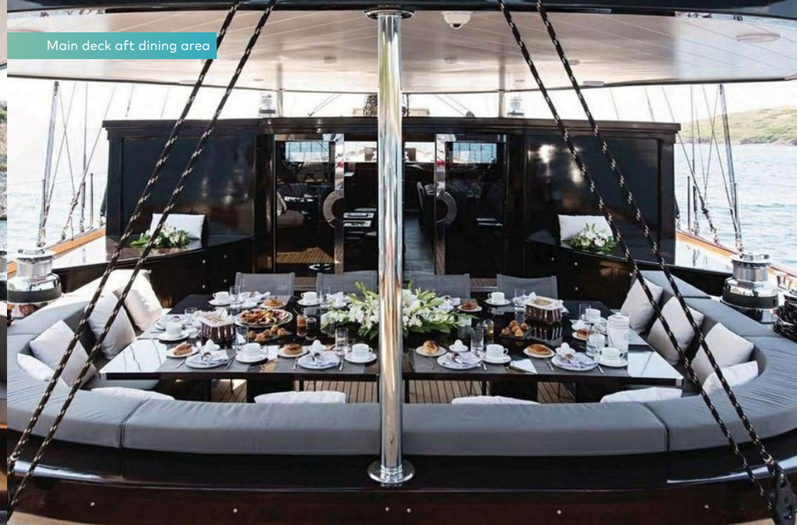
Main deck aft dining area