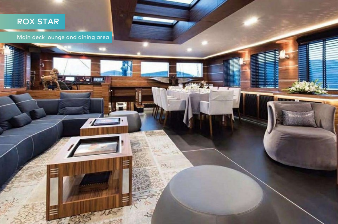
Main deck lounge and dining area