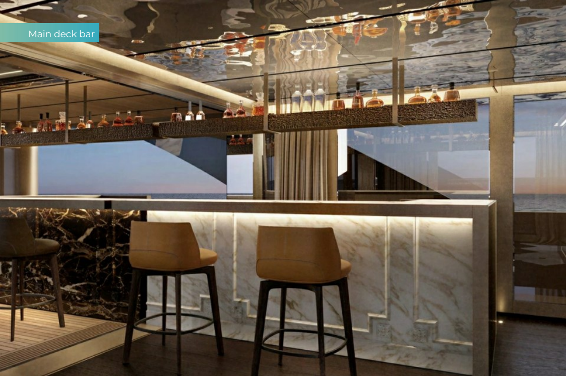
Main deck bar