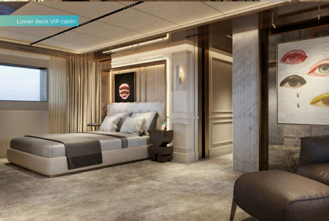
Lower deck VIP cabin