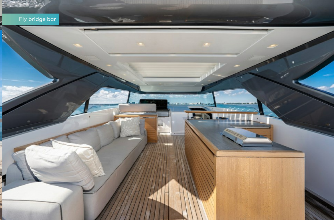
Fly bridge bar