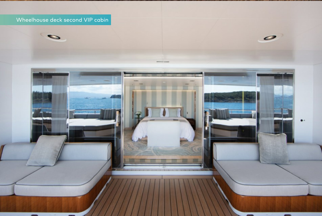
Wheelhouse deck second VIP cabin