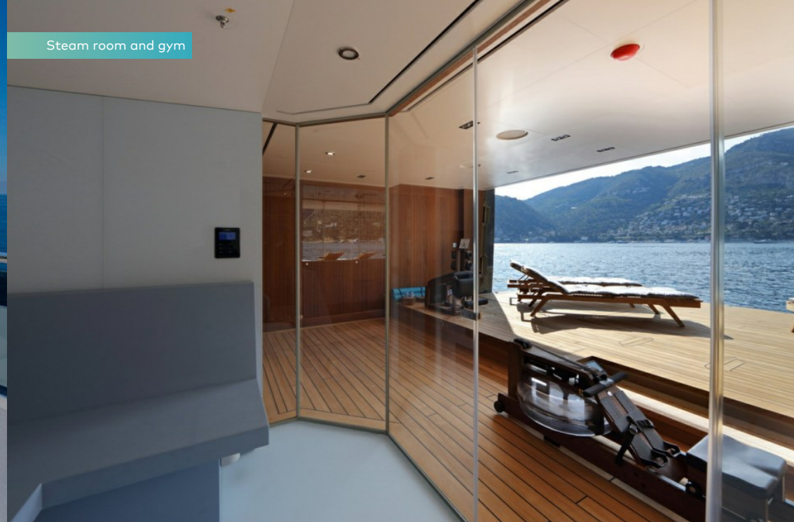
Steam room and gym