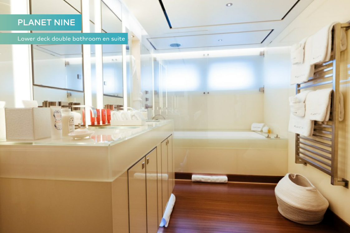
Lower deck double bathroom en suite