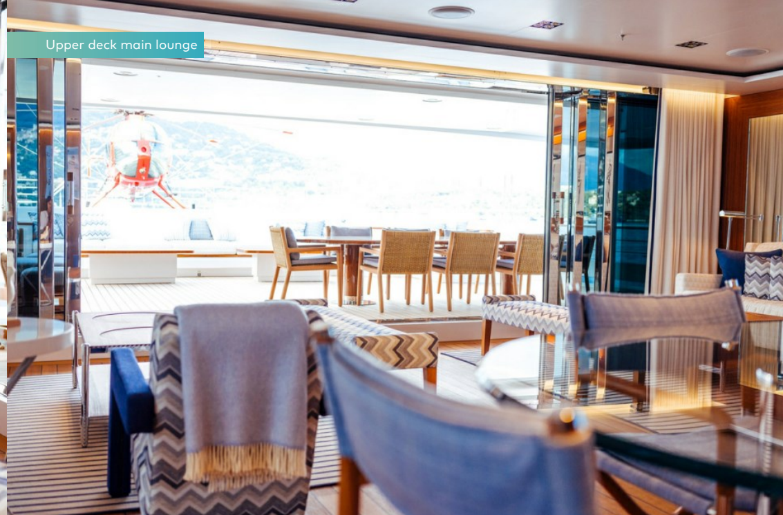
Upper deck main lounge