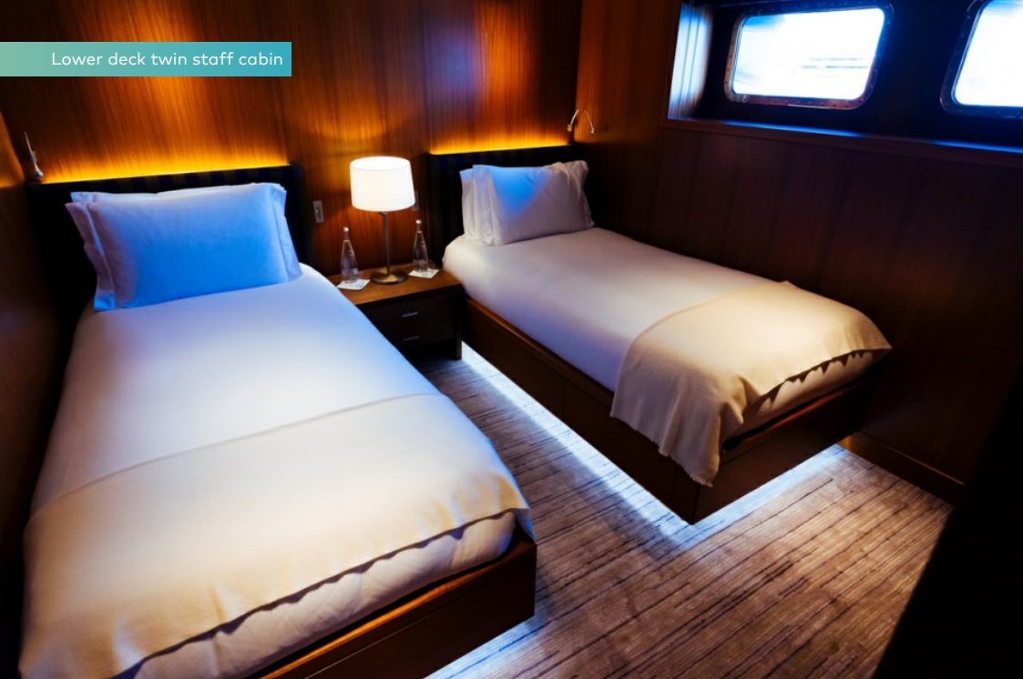
Lower deck twin staff cabin