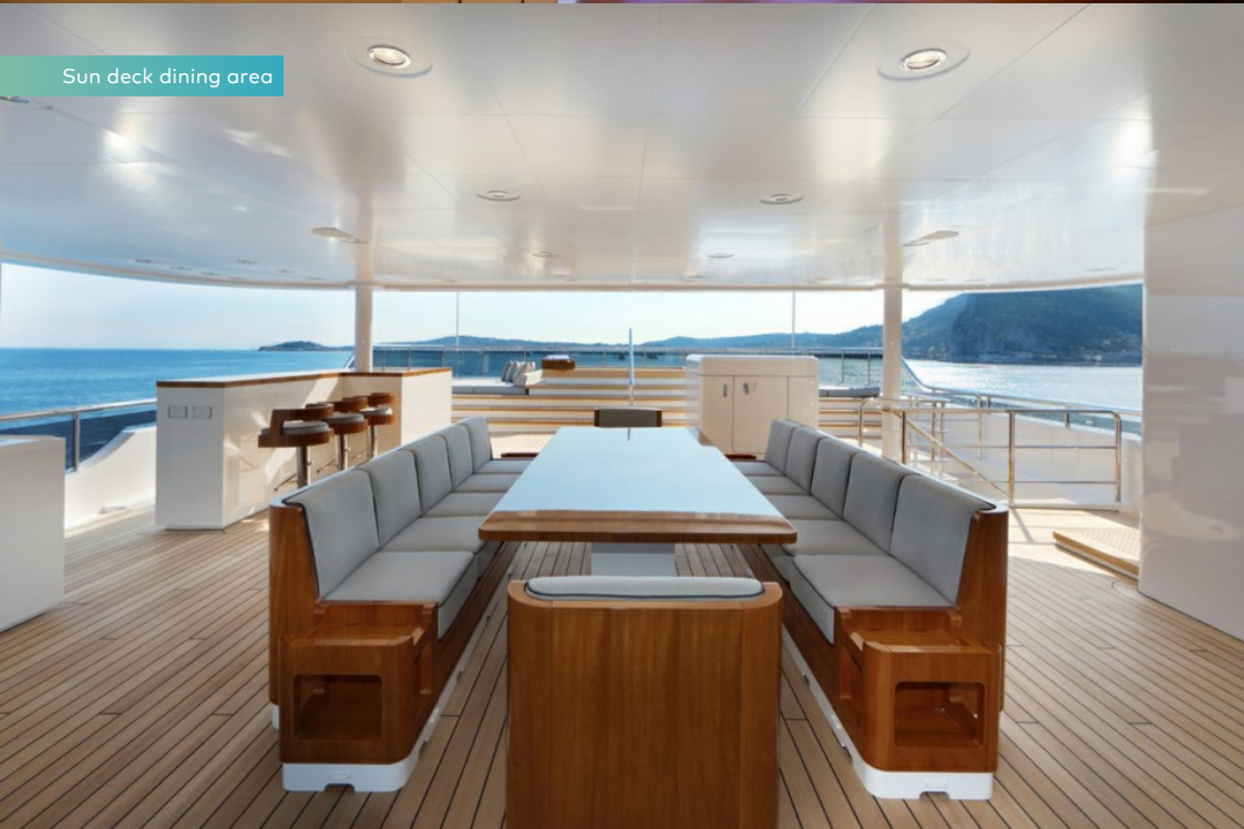
Sun deck dining area