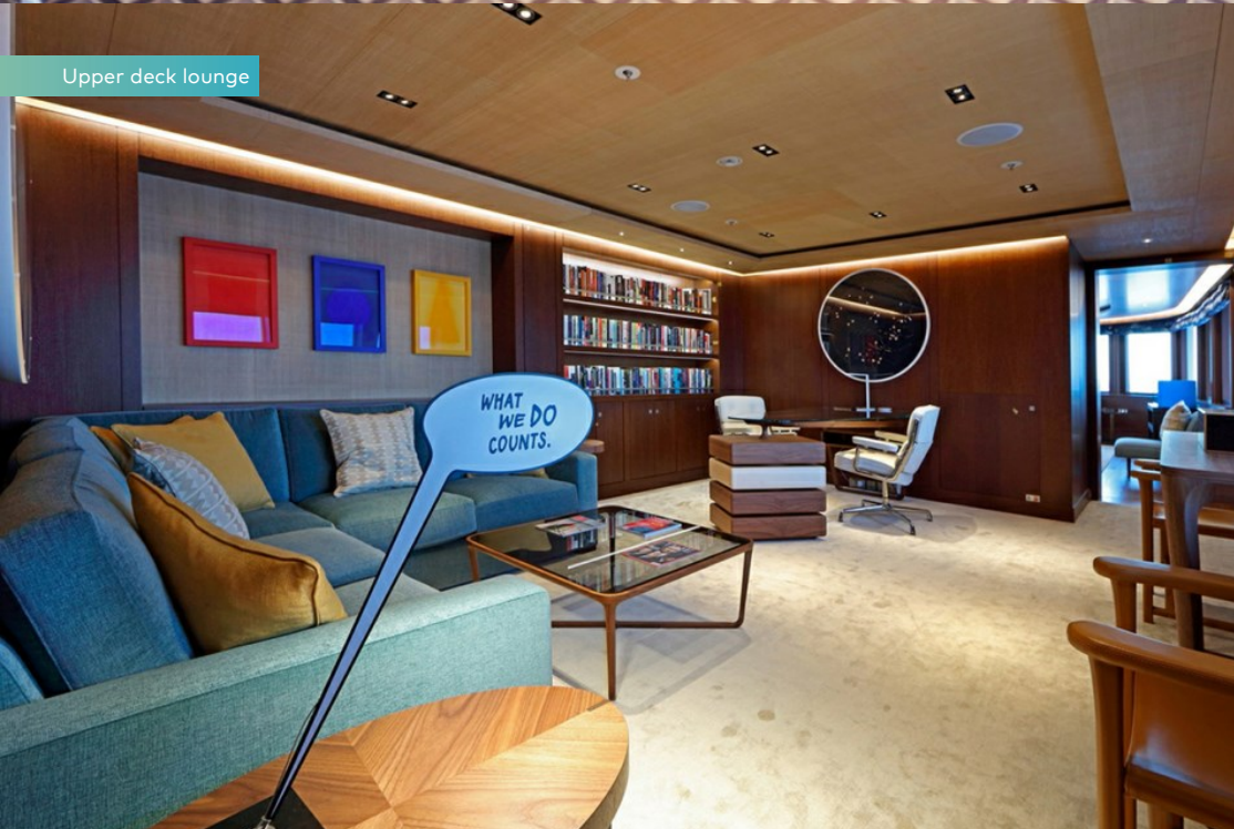
Upper deck lounge