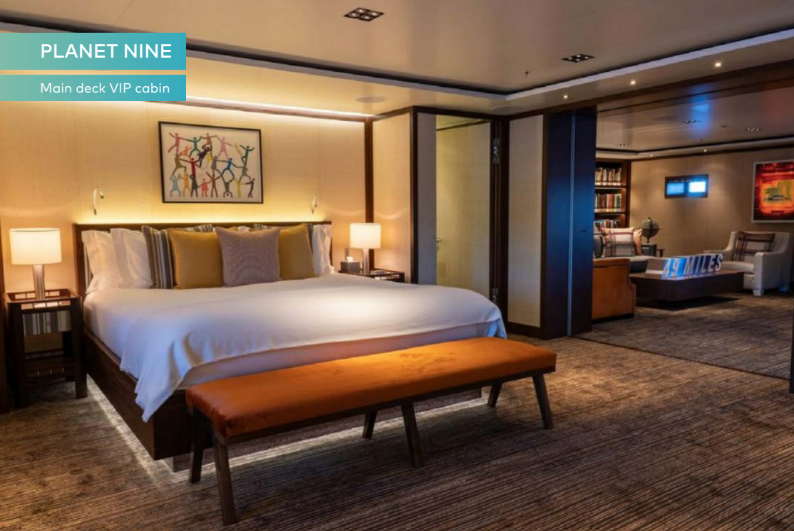
Main deck VIP cabin