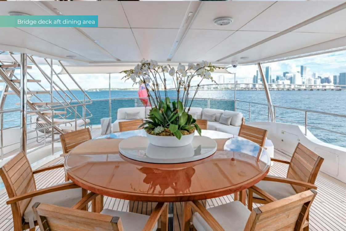
Bridge deck aft dining area