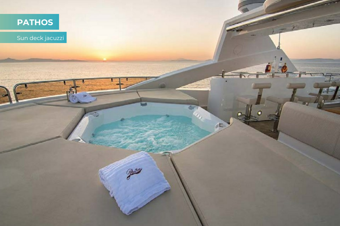
Sun deck jacuzzi