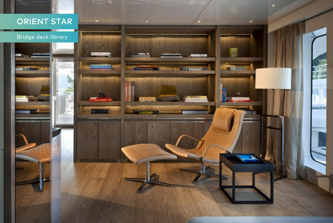
Bridge deck library