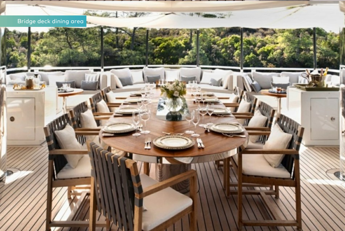
Bridge deck dining area