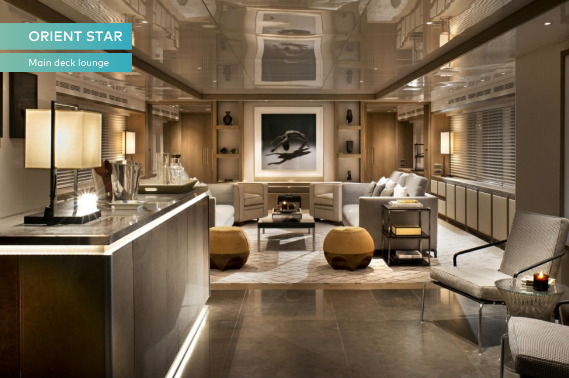
Main deck lounge