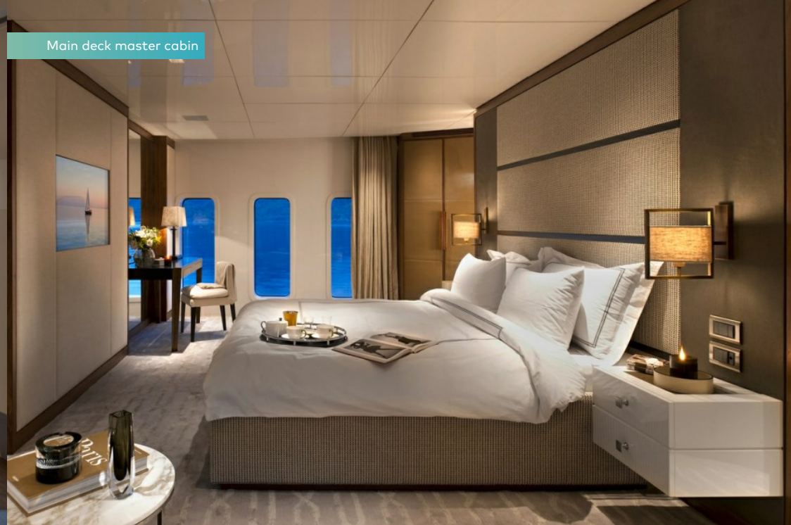
Main deck master cabin