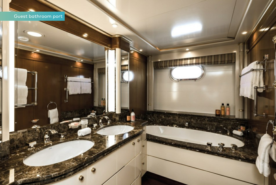
Guest bathroom port