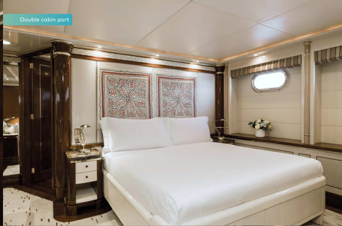
Double cabin port