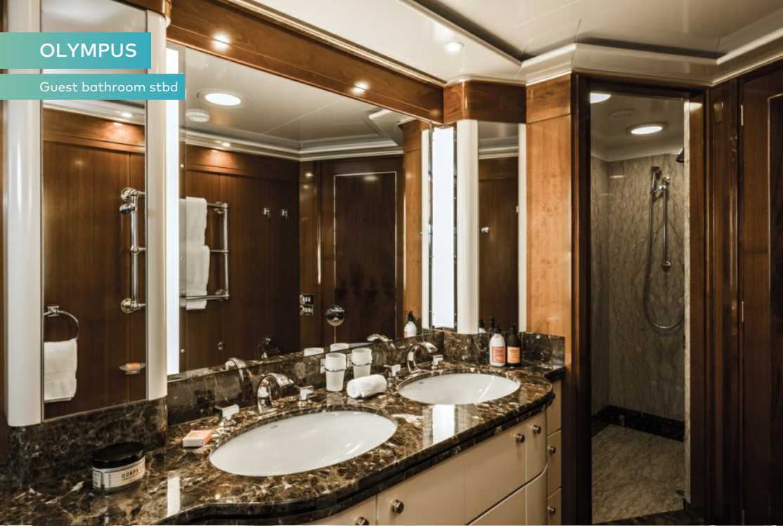
Guest bathroom stbd