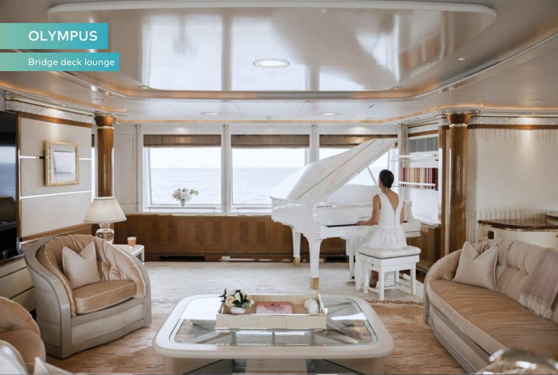
Bridge deck lounge