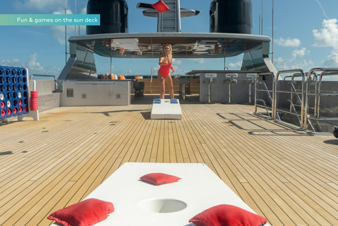
Fun & games on the sun deck