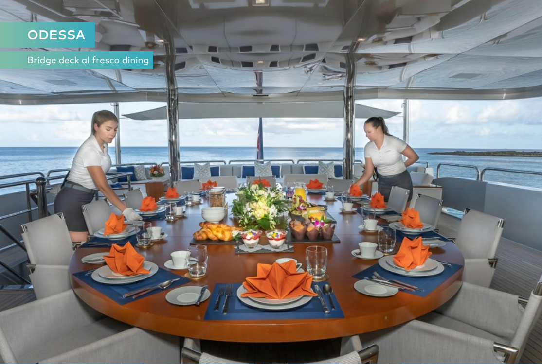
Bridge deck al fresco dining