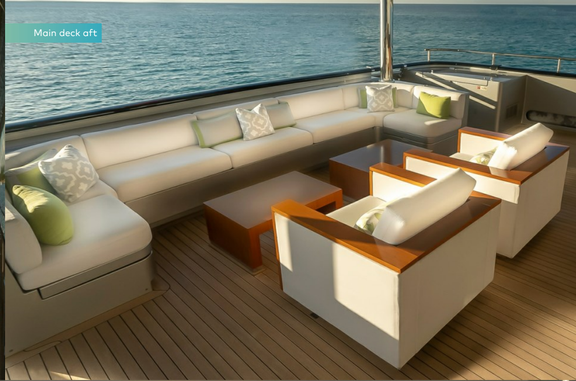
Main deck aft