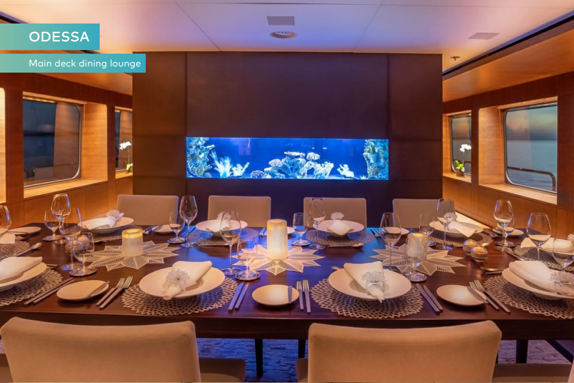
Main deck dining lounge