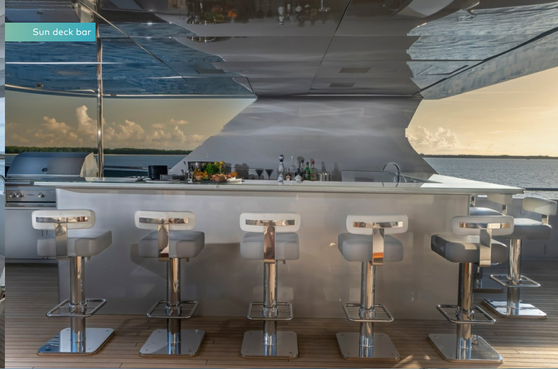
Fun & games on the sun deck