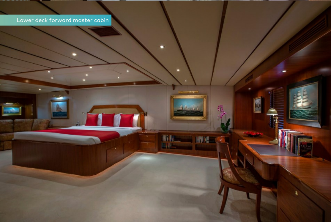
Lower deck forward master cabin