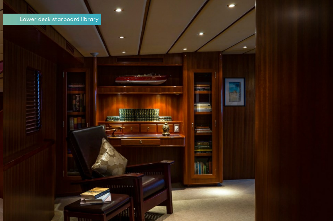
Lower deck starboard library