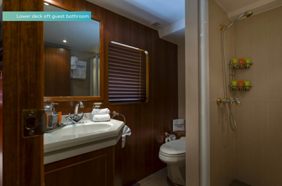
Lower deck aft guest bathroom