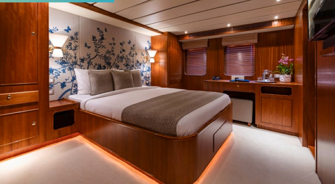
Lower deck aft guest double cabin