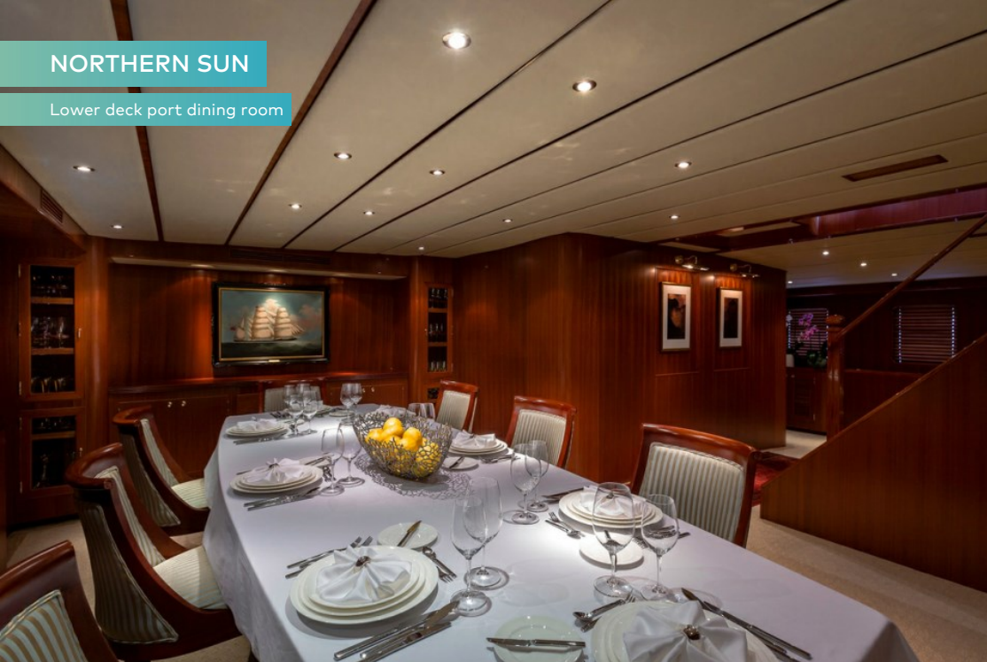
Lower deck port dining room