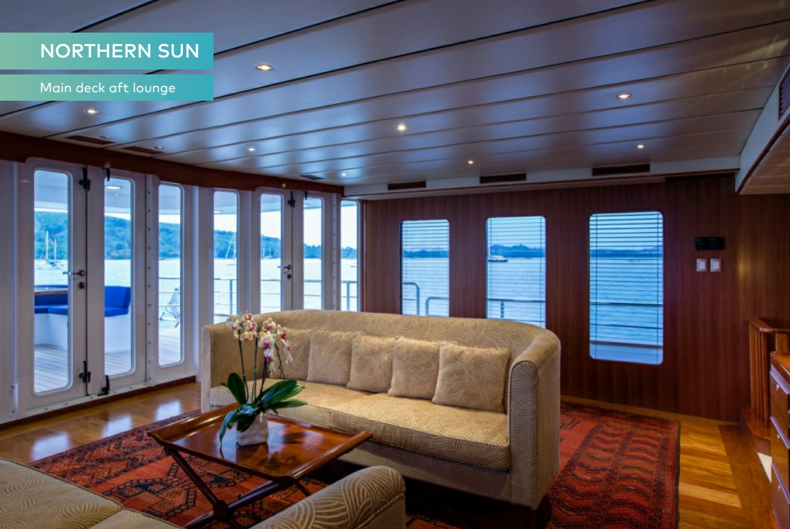
Main deck aft lounge