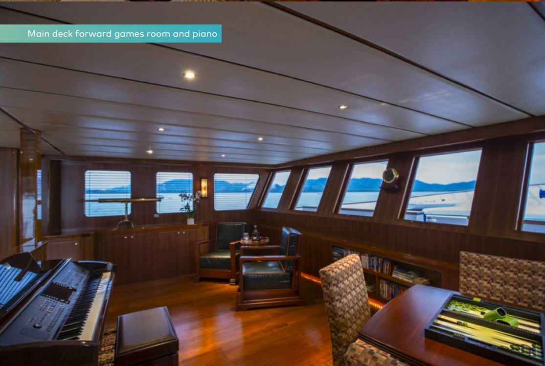
Main deck forward games room and piano