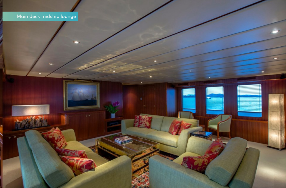
Main deck midship lounge